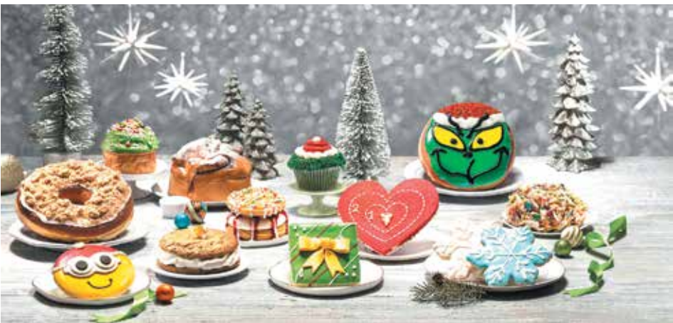
GRINCHMAS FOOD and other food items offered at Universal during the holidays.

of shimmering lights, decorative garlands and festive wreaths. Guests can take delight in special holiday a cappella performances from the Frog Choir, stroll through the village shops while sipping delicious hot Butterbeer™ or savor festive fare at Three Broomsticks™. Beginning at dusk each night, “The Magic of Christmas at Hogwarts™ Castle” will dazzle with stunning imagery as the impressive light projection show illuminates Hogwarts™ School of Witchcraft and Wizardry, bringing the iconic Hogwarts™ castle to life and infusing the land with the sounds of an arrangement of music from the Harry Potter film series.