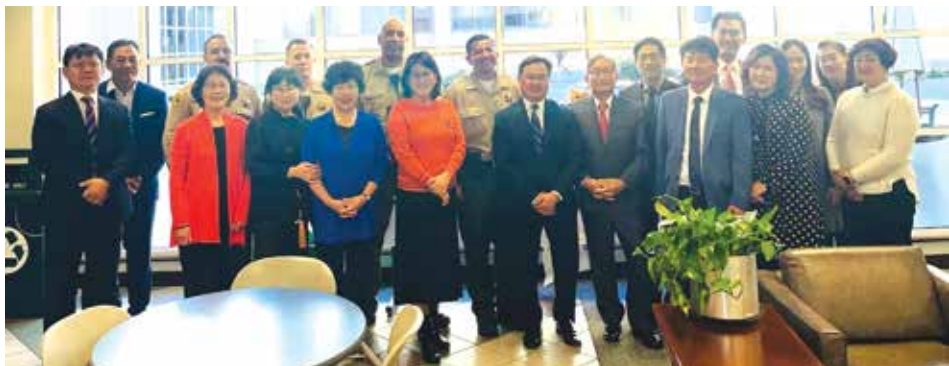
MEMBERS of the Cerritos Mission Church brought a big floral arrangement and Thanksgiving meal for Cerritos Sheriff's Station Deputies and personnel.