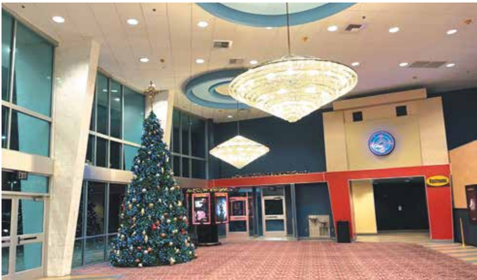
NEWLY RE-OPENED Starlight Lakewood Center Movie Theatres in Lakewood Center Mall celebrates with beloved holiday films for a limited time.

Lakewood, CA - This December, Starlight Lakewood Center Theatres presents classic Christmas movies playing in its premier 70-foot-screen auditorium for only $5 admission. Elf , the 2003 Will Ferrell comedy, will play on December 6th at 4:40 PM, 7:00 PM, & 9:20 PM. Irving Berlin’s 1954 musical White Christmas will play on December 13th at 4:15 PM, 7:00 PM, & 9:45 PM. It’s a Wonderful Life , the 1946 film considered one of the greatest movies ever made, will play on December 20th at 4:10 PM, 7:00 PM, & 9:50 PM. Tickets are available to purchase now at StarlightCinemas.com or at the theater box office. Starlight Lakewood Center Theatres is now open and playing the latest film releases every week. Starlight Cinemas, a community-focused theater business with seven total locations all in Southern California, rebranded and re-opened the enormous 16-plex Lakewood Shopping Center building in August of this year, restoring much of the