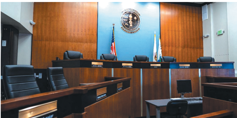
La Palma Council Chambers: residents can place term limits if measure is passed

"The reality is, every four years, the voters can