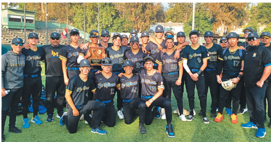
LA MIRADA HIGH baseball team fell to Orange Lutheran High 7-6 last Saturday evening in the championship game of the CIF Southern California Division I Regionals. It was the first time the Matadores had played in the finals of the regionals, which began in 2021.