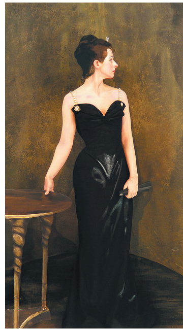
John Singer Sargent's Madame X.