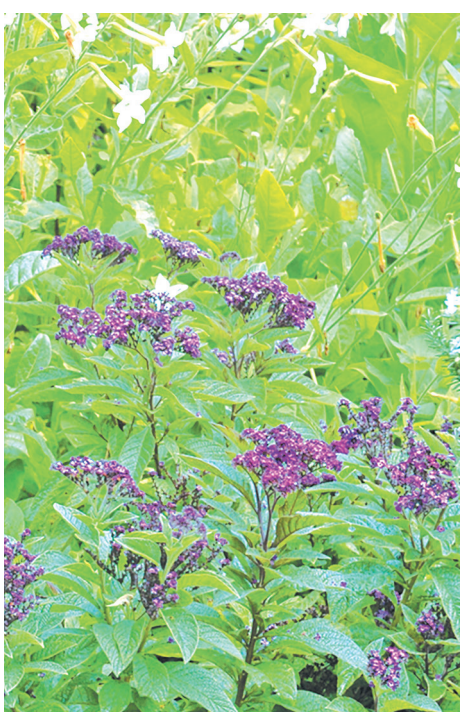
AROMATHERAPY: Heliotrope, nicotiana and other fragrant flowers can provide aromatherapy at the end of a stressful day. Others include Lavender, Chamomile, Eucalyptus, Mint, Jasmine, Lemon Balm, Sage, Rosemary, Lilac, Basil, and Fennel.

Pace yourself so you can enjoy the process and smell the roses, heliotrope, daphne and alyssum along the way. Gardeners have been into aromatherapy long before its recent rise in popularity. A few strategically placed fragrant flowers can create a delightful welcome home, soothing scent in your secret garden or aromatherapy as you weed and tend your landscape. Include some edible flowers and fruit for you, the birds and the butterflies. Nothing beats the flavor or nutritional value of fresh-from-the-garden fruits and vegetables. Plus, watching the butterflies and hummingbirds sip on nectar from a fuchsia, coral honeysuckle, verbena or salvia as the finches feed on coneflower seeds will provide added beauty while the squirrels' acrobatic antics on giant sunflowers are sure to entertain. If the task is too big or your time is limited, ask for help. Gardening can also