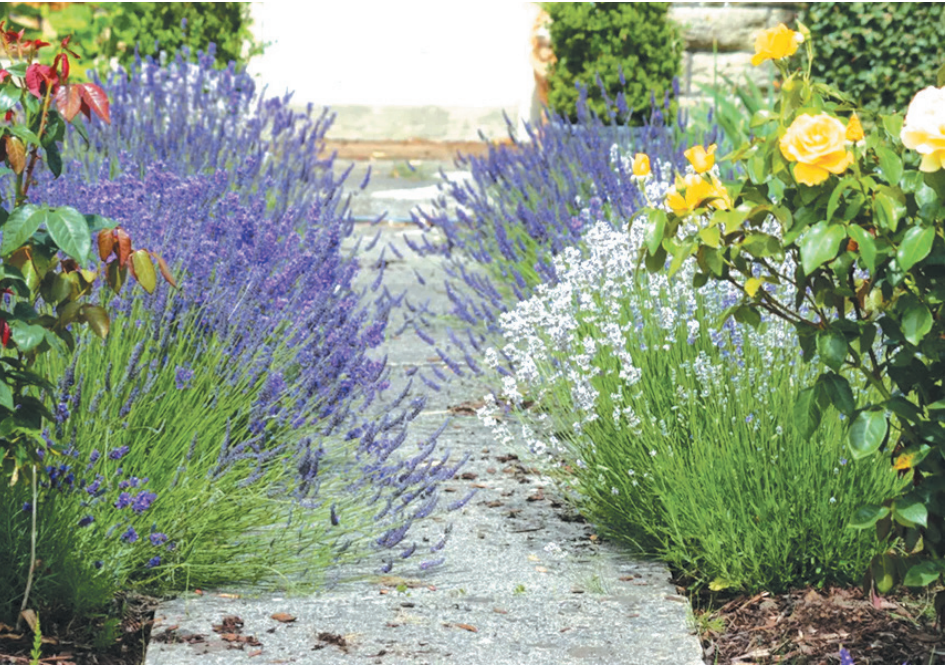
ENJOY THE BENEFITS of aromatherapy year-round by planting a garden that enhances your mood, relieves stress, and improves your well-being. Aromatic plants make excellent additions to outdoor spaces because they naturally release essential oils into the air when their leaves are rubbed or crushed. They also can be used in cooking and home remedies, making them useful multitaskers in any garden.

be a great team sport. Or make it a round robin as you take turns gardening in each other's gardens. You'll all enjoy a day filled with gardening, conversation and laughter. What was once an overwhelming task suddenly becomes a chance to spend time with friends, enjoy the garden and create new memories. Sharing your knowledge, plant divisions or other talents like cooking or pet sitting may be the perfect trade for your friends' time and energy. And as a wise person once said "Planting a garden is a way of showing you believe in tomorrow."