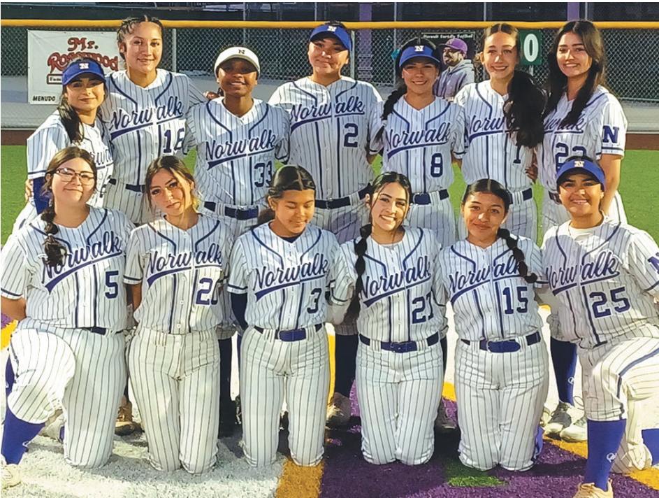
THE NORWALK HIGH softball team, moments after scoring three runs in the bottom of the seventh inning against Covina High in a 5-4 victory. It would be Norwalk's last home game of the season, where the Lancers went 9-4.