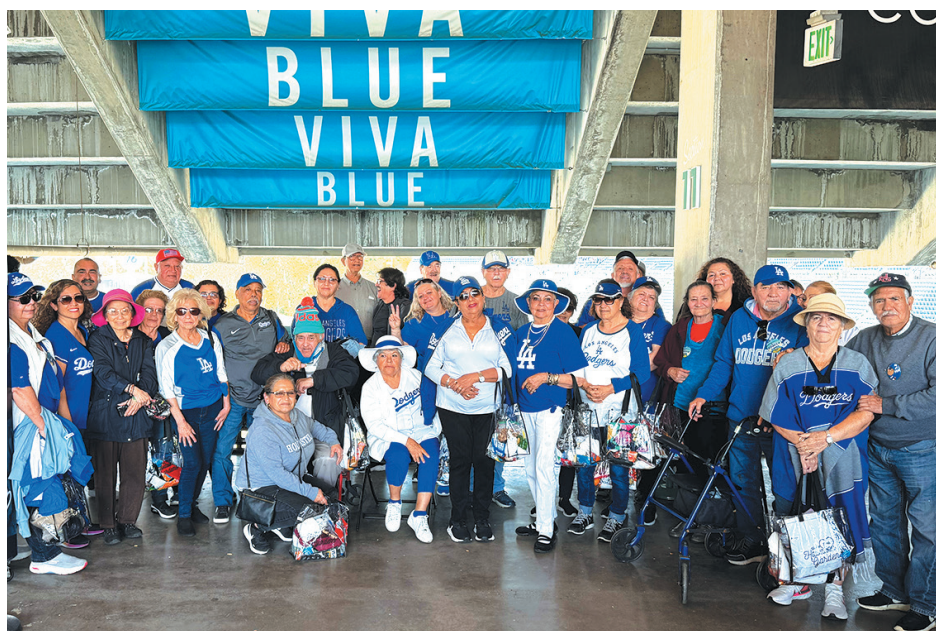
FORTY HAWAIIAN GARDENS fans from the senior center attended the April 17 Los Angeles Dodgers versus Washington Nationals game.