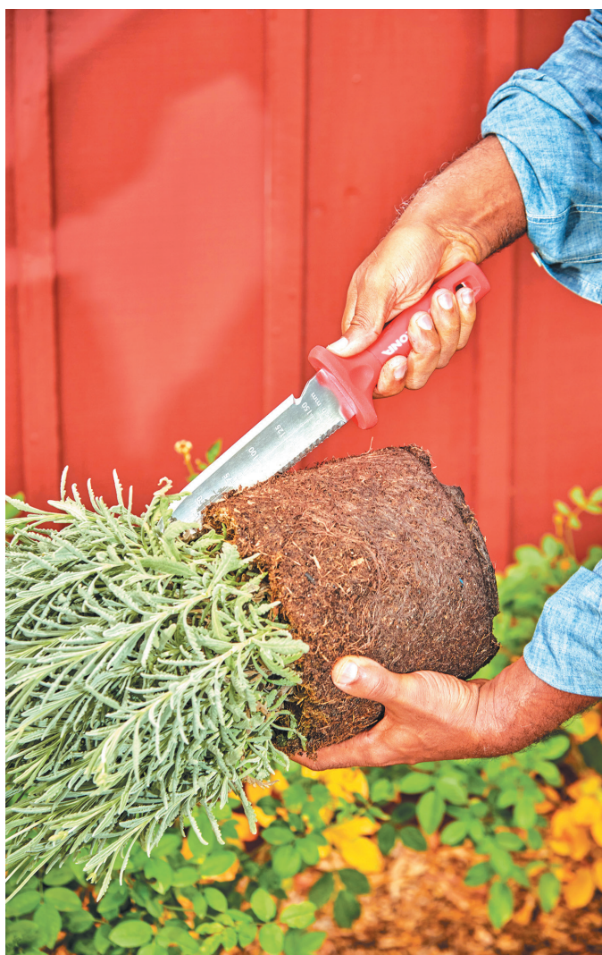
DIVIDE AND CONQUER: When dividing perennial plants use a sharp spade or Hori Hori garden knife to easily cut plants.

Start by dividing just one or two overgrown plants. As you master the technique, you will find it easier to divide perennials when needed to keep your gardens looking their best.