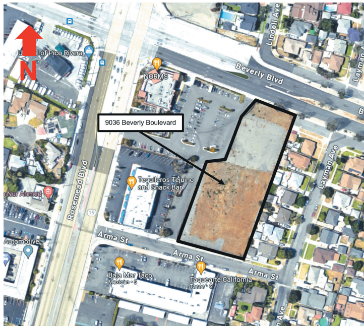
Publicado en Noticias de la Comunidad de Los Cerritos 4/26/24