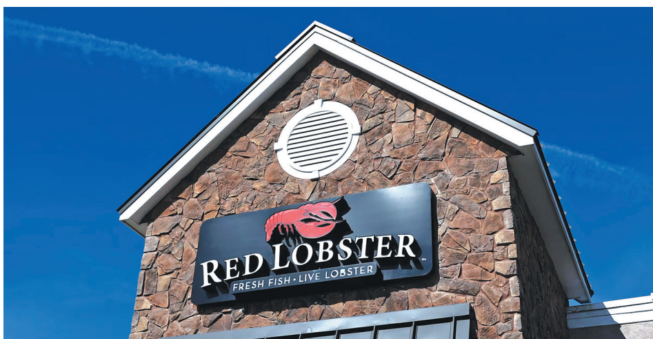
END OF ENDLESS SHRIMP? Red Lobster seeks a buyer as it looks to avoid bankruptcy filing.