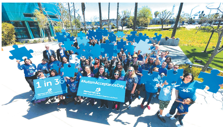
AWARENESS: Leaders from Miller's and Stramski Developmental Center, along with Long Beach Fire Department firefighters, volunteers from the Steel Magnolias, patients, community members, hospital staff holding up 36 blue puzzle pieces and one white puzzle piece representing the 1 in 36 autism statistic of children being diagnosed in the U.S.