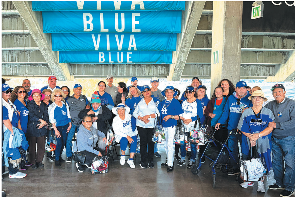
FORTY HAWAIIAN GARDENS fans from the senior center attended the April 17 Los Angeles Dodgers versus Washington Nationals game.