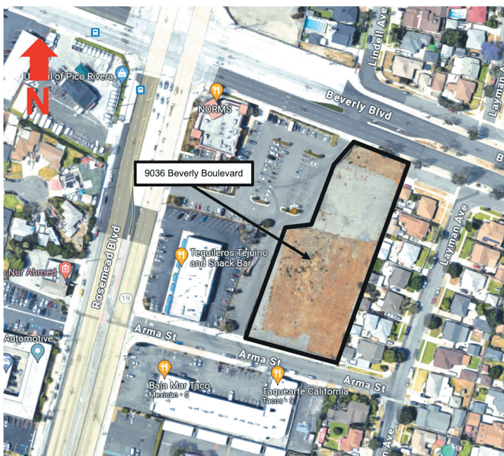
Publicado en Noticias de la Comunidad de Los Cerritos 4/26/24