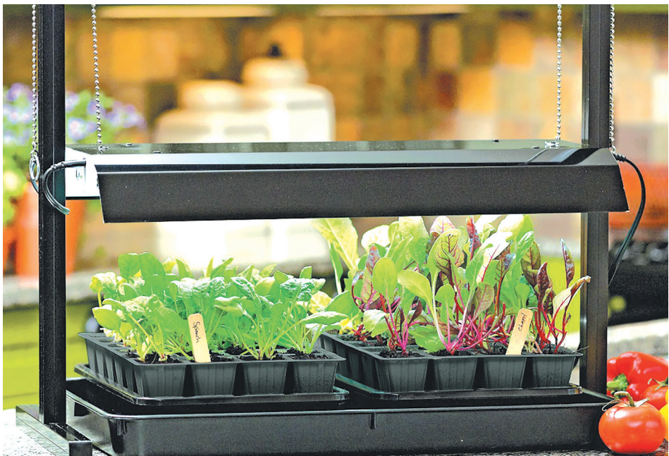
TABLETOP light stands work well on kitchen counters and provide plenty of light for greens to grow.