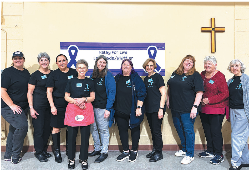
TEAM WE WALK hosted their largest Bunko game day with over 100 attendees. 29 game tables were prepared with every seat occupied.