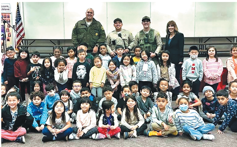
FEBRUARY 6 was a very rainy day, and full of excitement for these young students. Cerritos Deputies were invited to be guest speakers at an assembly with all of the Kindergarten students at Wittmann Elementary School in ABCUSD. The children learned about safety, community and what it means to be a Deputy Sheriff.