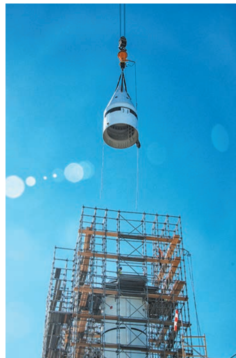
THE FORWARD ASSEMBLIES (cones) lowered onto the SRBs

"I am thrilled to announce the completion of a significant Go for Stack mile-