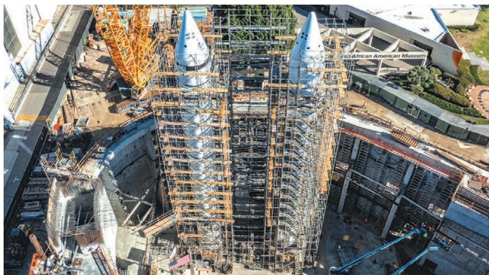
THE FINISHED BOOSTERS are the latest milestone in the Science Center's Go for Stack operation — the multi-phase process of constructing the world's only complete, authentic space shuttle system display.