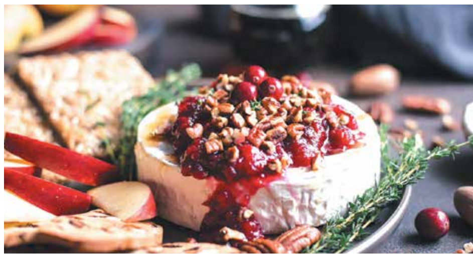
Baked Brie with Pecans and Cranberry Orange Chutney

sheet with parchment paper or silicone baking mat.