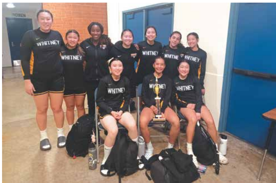
THE WHITNEY HIGH girls basketball team, which lost its first game of the season last Friday night, finished in third place of the Glenn-Norwalk varsity basketball tournament.