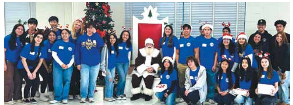
SANTA'S ELVES – A group of La Mirada High School Interact students, sponsored by the Rotary Club of La Mirada, helped more than 40 elementary school students purchase new clothing in Rotary's annual Clothes for Kids program at Marshalls Department Store.