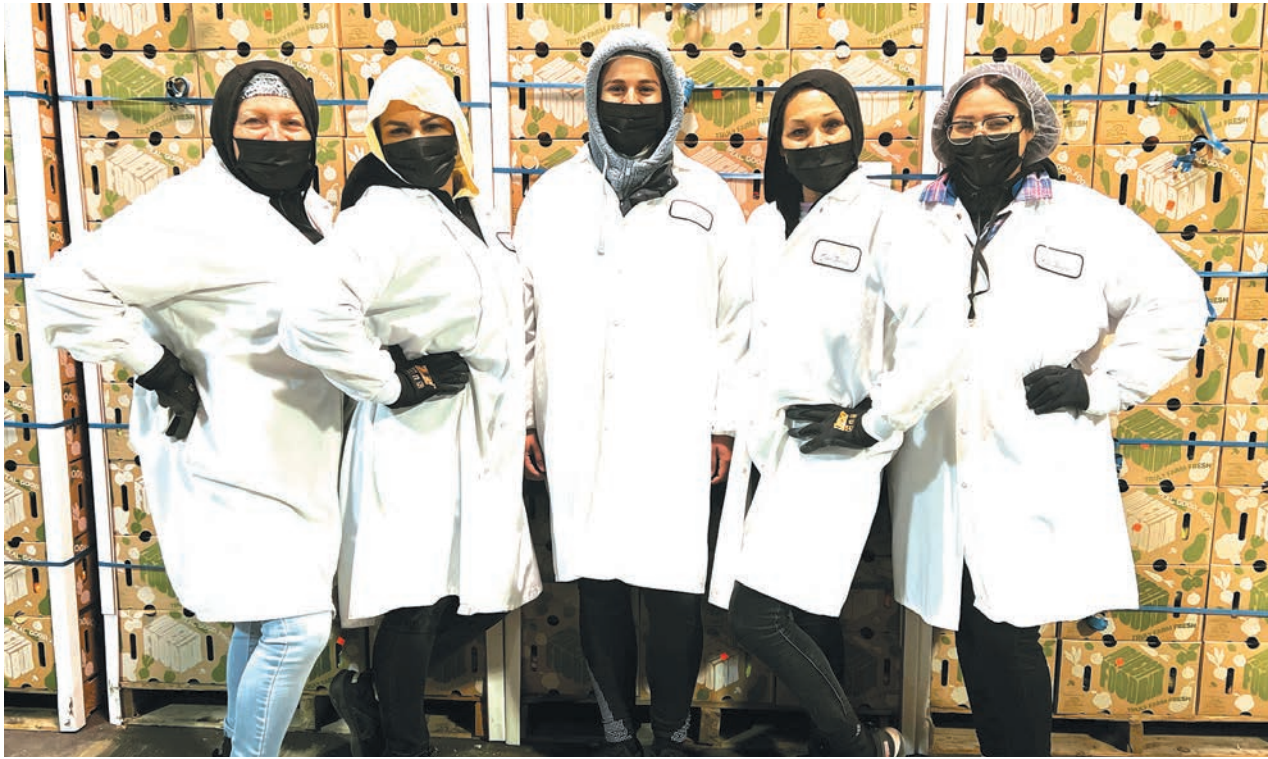
PROVIDING PRODUCE: SunTerra Produce employees are proud of their work providing nutritious produce and food to those in need as part of Project FoodBox. The program, which started during COVID-19, now supplies food banks and is partnering with Medi-Cal throughout California including Los Angeles and Orange County.

“The turkey. The sweet potatoes. The stuffing. The pumpkin pie. Is there anything else we can agree so vehemently about? I don’t think so.” ~ Nora Ephron