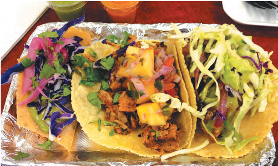
STR8 UP TACO'S Al Pastor taco especial plate with pickled onions, cilantro and salsa.