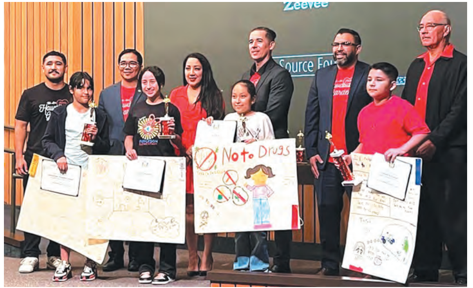
THE HAWAIIAN GARDENS CITY COUNCIL recently recognized Furgeson Elementary School students for winning the Red Ribbon Week Poster Contest, October 23-27. All students received certificates and trophies, along with winning entrants from other city schools. Each year all area cities and school districts sponsor activities to remind students of the dangers of illegal drug use.