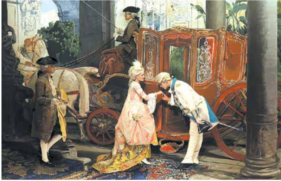
KISS THE HAND tableaux during the Pageant.