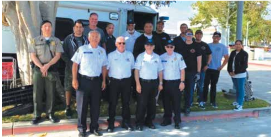
ETCH AND CATCH: Cerritos Sheriff's, volunteers, and Code Enforcement officials held a catalytic converter etching event at City Hall where over 170 cars showed up. Catalytic converter's can cost up to $1000 to replace.