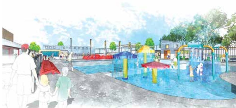
NEW POOL AND COMMUNITY CENTER: (top) artist's rendition of the new Smith Park Center, a sprawling complex to be completed in the summer of 2025. Amenities will include a diving board at the appropriate pool depth; stadium seating for parents and others to use during events and competitions, as well as family-friendly seating areas for casual use. A small water-park type recreation area (left) for families, with a zero-depth entry point pool and a seamless entry into the pool for small children and older adults.

Top 10 qualify for a FREE Buy-In into the