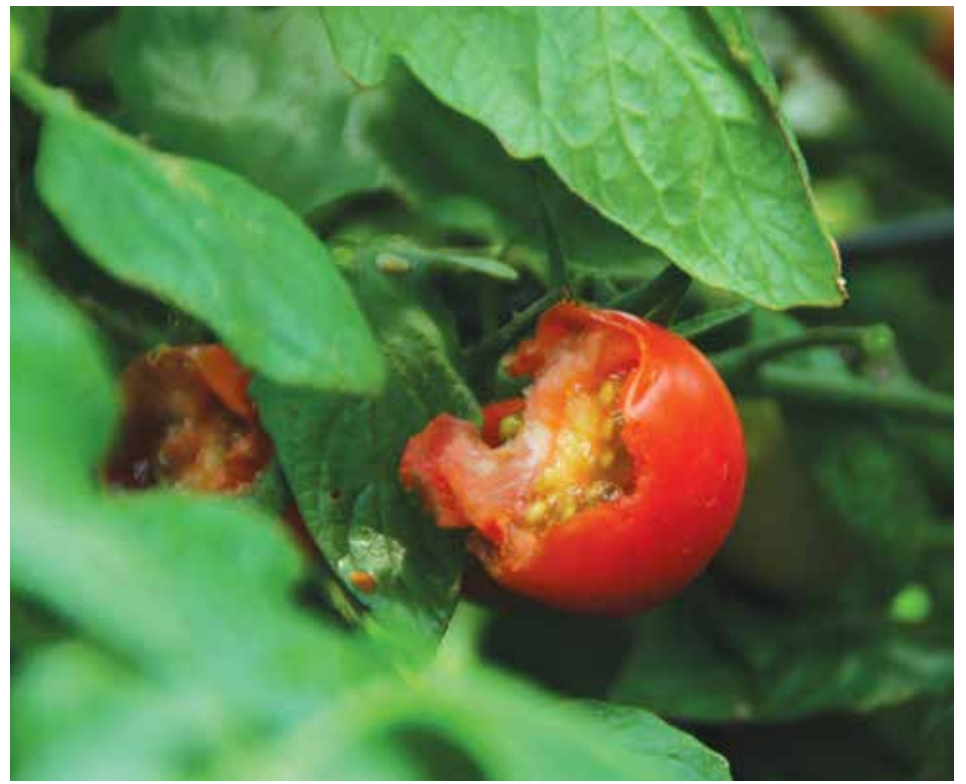
DAMAGE to a tomato plant after being visited by a hungry critter; rabbits, deer, voles, squirrels, chipmunks leave telltale signs when your garden shows damage.

Fencing tight to the ground with a secure gate and at least 3 feet – preferably 4 feet – high is effective for preventing rabbit damage. Deer on the other hand need a much taller fence. Although they can jump 7 feet or higher, a 5-6' fence is often enough to keep them out of smaller gar-