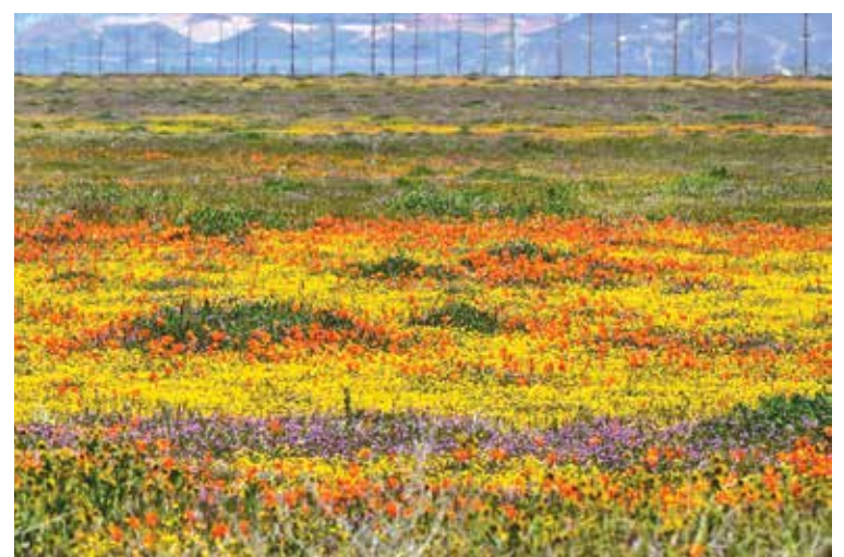
SUPERBLOOM is occurring all over the state, this picture taken at the Antelope Valley California Poppy Reserve in Lancaster about an hour and a half north of Los Angeles. Closer is Chino Hills State Park.