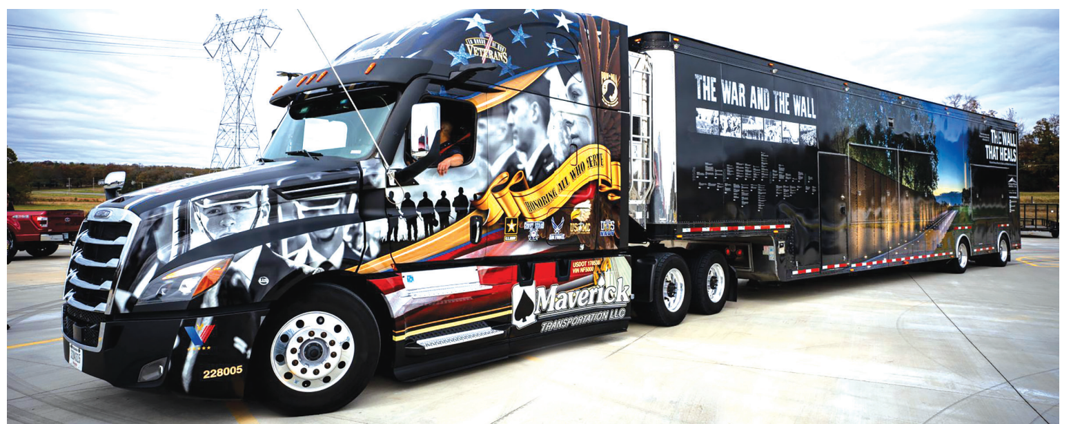
THE SEMI-TRUCK that carries the Wall That Heals Education Center coming to Hawaiian Gardens in March 2023. It is a huge honor for the city; the 2023 exhibit will visit only 32 cities in the United States.