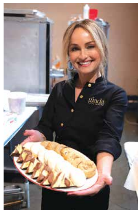
CHEF and Emmy award-winning television personality, Giada De Laurentis, provided the cuisine for the evening.

Guests filled the halls with laughter, and enjoyed live entertainment and rich Italian cuisine, while they celebrated in the big apple ambiance.