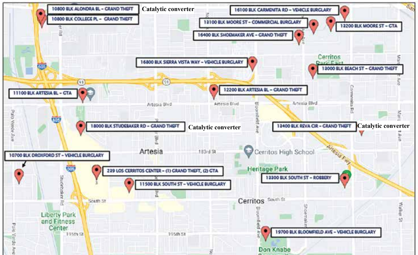
CERRITOS WEEKLY CRIME SUMMARY map showing location and type of burglary.