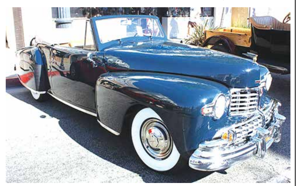
BELLFLOWER'S ANNUAL CAR SHOW happens this weekend, hosting the event is the city along with the Bellflowerr Lions Club. Enjoy live music, local business booths and vendors with all types of cars on display. Saturday, September 24th at Downtown Bellflower located on Bellflower Boulevard between Park Street and Flora Vista Avenue, open from 2-7 PM.