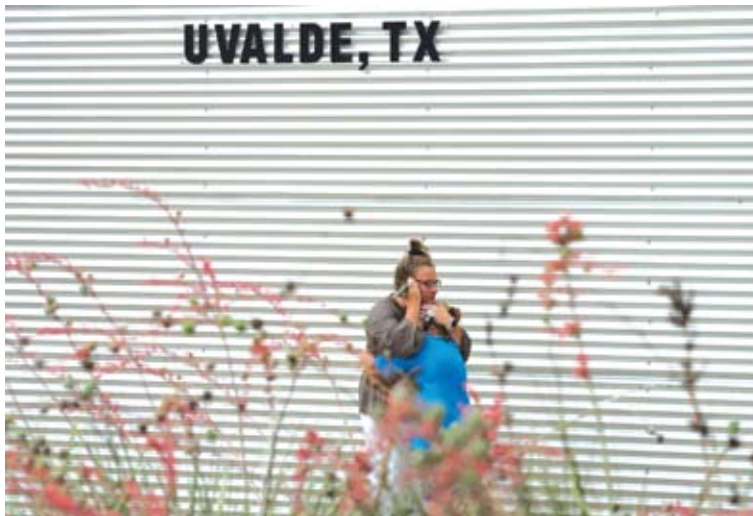
A WOMAN CRIES and hugs a young girl while on the phone outside the Willie de Leon Civic Center where grief counseling was offered in Uvalde, Texas, on May 24, 2022.

The organization said it started the fund "to make sure that