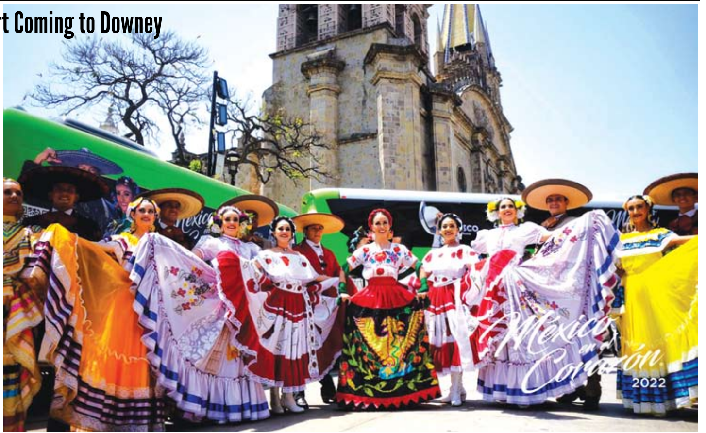
THE MÉXICO EN EL CORAZÓN CONCERT will be held on Wednesday, June 1 at the Downey Civic Theater with the social hour beginning at 6:30 and the program at 7:00 pm. Se the Mariachi Femenil Estrella de México, the Banda Colores, as well as choreographies and dance of the Ballet Folclórico Guadalajara internationally recognized for preserving and spreading the traditions and dances of Mexico.

The performance will consist of a cast made up of talented musicians and singers such as the Mariachi Femenil Estrella