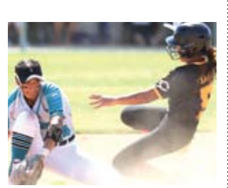
Cerritos HS Out of Playoffs Softball team gets runners on but can't cash in. Page 6.