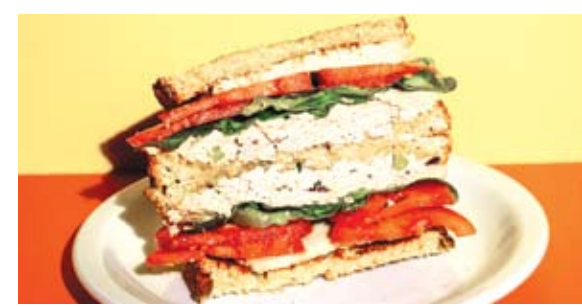
The Next Big Thing - Faux Fish Learn all about plant-based and cell-cultured fish. Page 8.