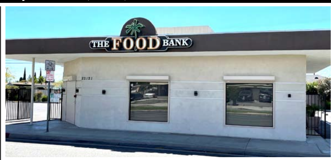
HAWAIIAN GARDENS FOOD BANK HELPING THE NEEDY

HELPING OUT: The Hawaiian Gardens Food Bank provides residents with free food and clothing that they can access every other week. It is funded by the Irving I. Moskowitz Foundation, owners of the Bingo Club in Hawaiian Gardens.