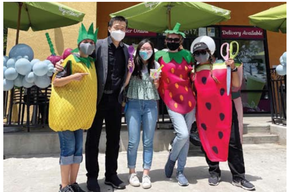
DANCING FRUIT poised for photo opportunities with happy guests trying out the new flavors at the Lakewood Yougurtland.

Fair organizers say the cooler May days and nights will be more conducive to fairgoers. Also, moving the fair to May aligns it with the celebration of Cinco de Mayo and Mother's Day and the summer kickoff of barbecues and national pride on Memorial Day weekend.