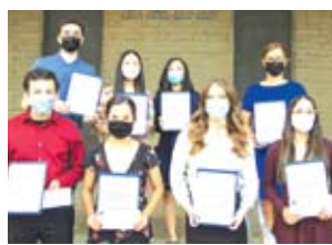
La Mirada Scholarships The LM Community Foundation gave out eight. Page 5.