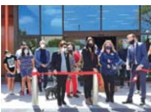
Downey Library Opens After 3 years and cleaning 100,000 pieces. Page 3.