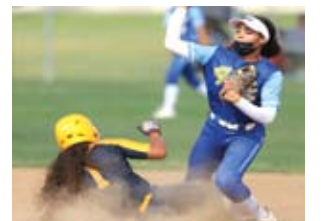
Gahr Streak Snapped Six straight league titles comes to an end. Page 11.