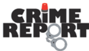
Fireworks Seized Police find drums full of fireworks in Lakewood. Page 6.