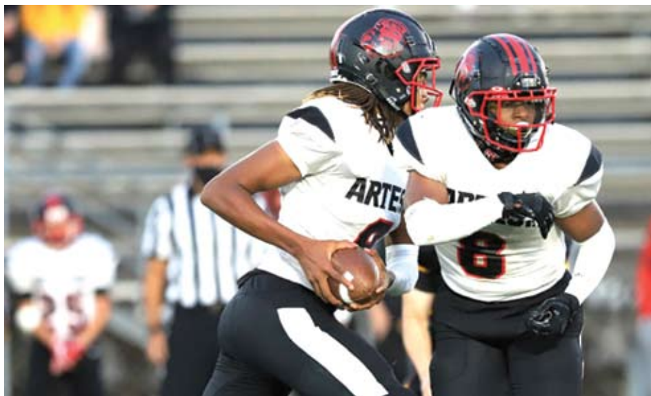
605 LEAGUE FOOTBALL