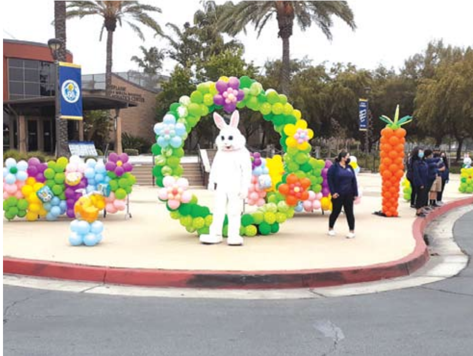
THE EASTER BUNNY and city staff greet La Mirada residents on Easter Sunday.