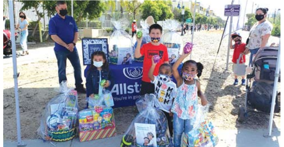
WOO-HOO! Lucky Easter egg hunters who found the special pink and green glass eggs that won beautiful Easter baskets filled with toys, snacks, movies, and treats.