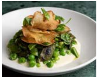
Chicharos de sierra

There are traditional starters like aguachile and ceviche, but also chicharos de sierra with fresh peas, serrano aioli, and crispy potato.