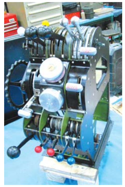
THE FULLY RESTORED pilot console of the Burnelli CBY-3 Loadmaster.