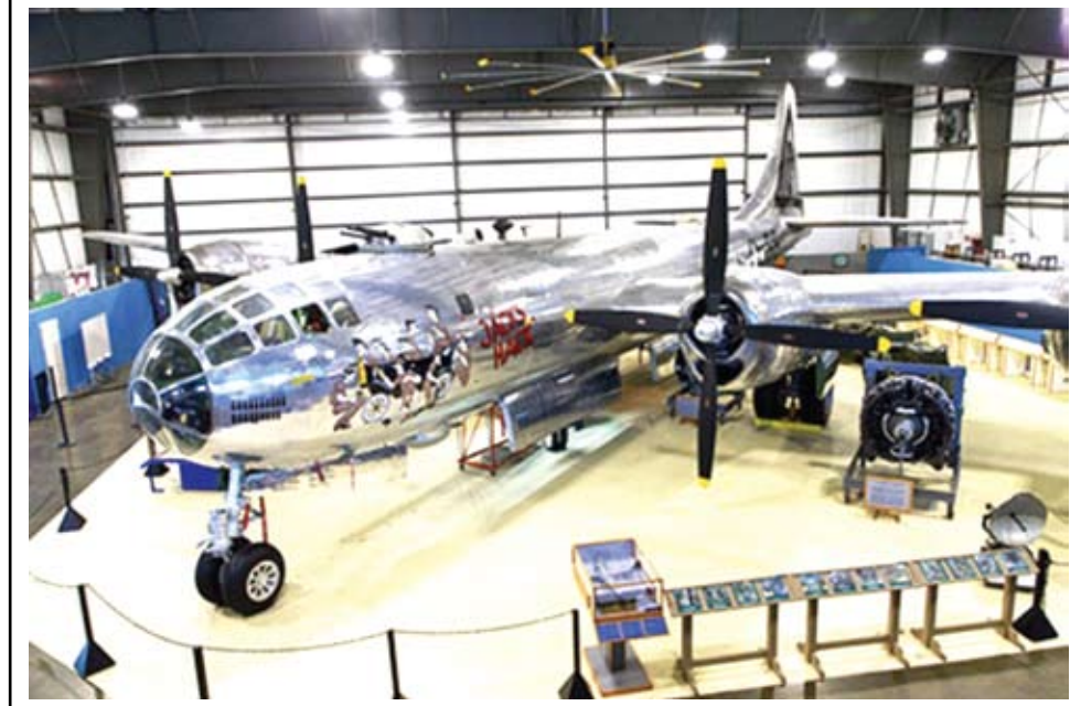
THE JAXS HACK restored B-29 Superfortress at the NEAM.

With plans for greater future expansions and new additions, the museum is now showing two new exhibits, the New England Women in