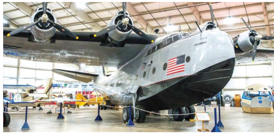
View From The Couch