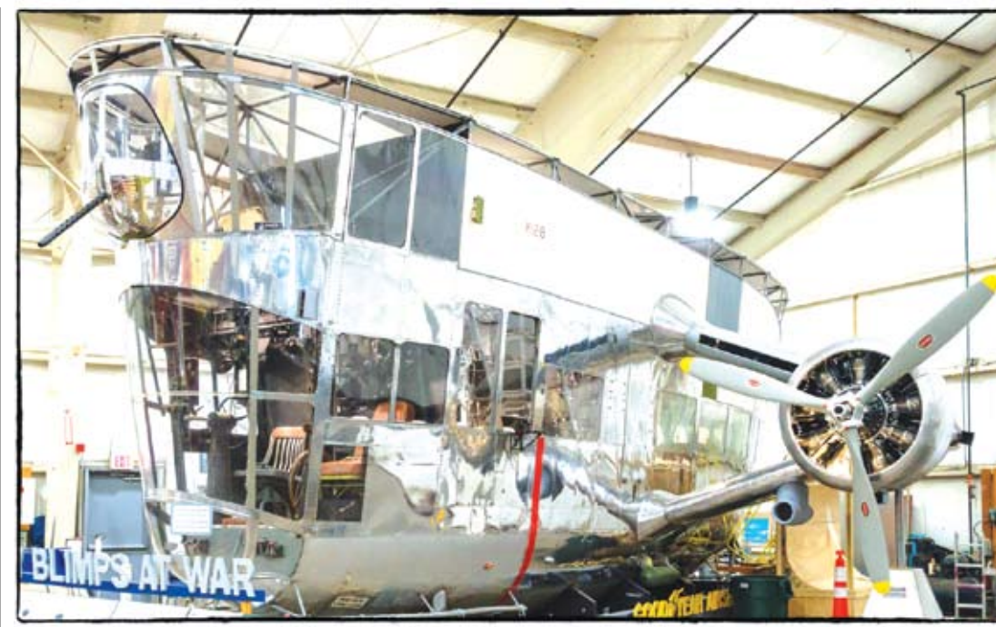
a Sikorsky VS-44 Excambian Flying Boat, a Burnelli CBY-3 Loadmaster, and a Goodyear ZNPK-28 Blimp Control Car."

Since June, the NEAM has been open but social distancing with its wide, open spaces allowing visitors to spread out over the 90,000 square feet of its extra-large hangars and five acres of open land. Their collection includes 115 aircraft, dozens of engines and artifacts with thousands of other items including news articles, photographs and more, all of which is viewable online.