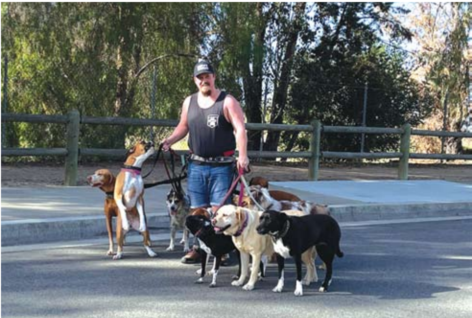
DOG WHISPERER: HMG Publisher saw this man in the neighborhood walking 10 dogs at once, without a problem. "They get along well, they like to walk."