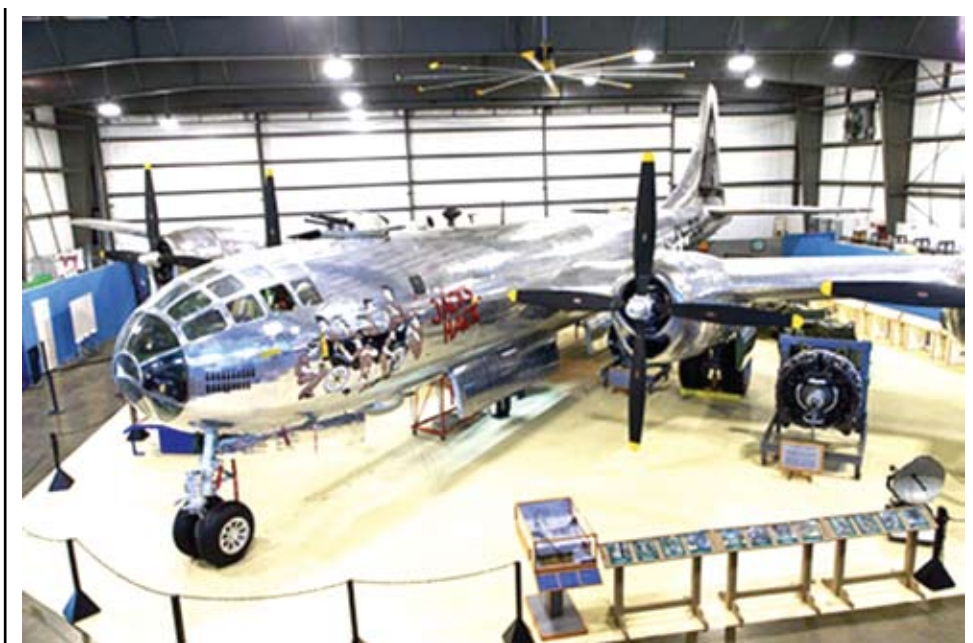
THE JAXS HACK restored B-29 Superfortress at the NEAM.

With plans for greater future expansions and new additions, the museum is now showing two new exhibits, the New England Women in Aviation, and the Kosciuszko Squadron. An exhibit underway will