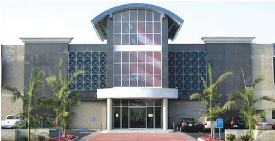
THE EAST WEST Ice Rink in Artesia is where two young skaters claim abuse by Peter Oppegard including one incident of Oppegard biting the arm of a student.

(USA TODAY) The U.S. Center for SafeSport is investigating 1988 U.S. Olympic pairs bronze medalist and renowned figure skating coach Peter Oppegard over allegations of physical abuse, according to emails obtained by USA TODAY