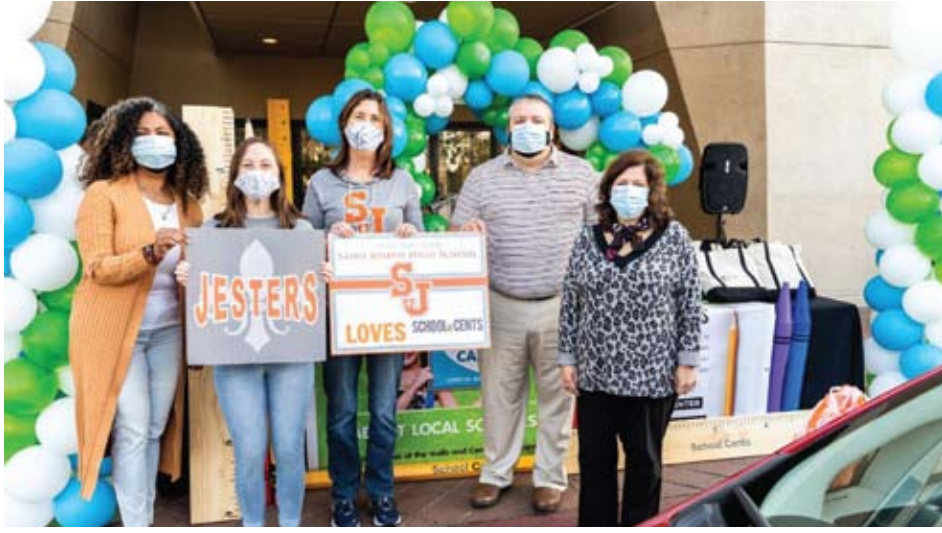
STUDENTS AND TEACHERS from 30 school received two laptops through the School Cents program run by local malls.

As an additional benefit to local schools the popular School Cents program donated 60 gently-used laptop computers for students and families in need at 30 participating schools.