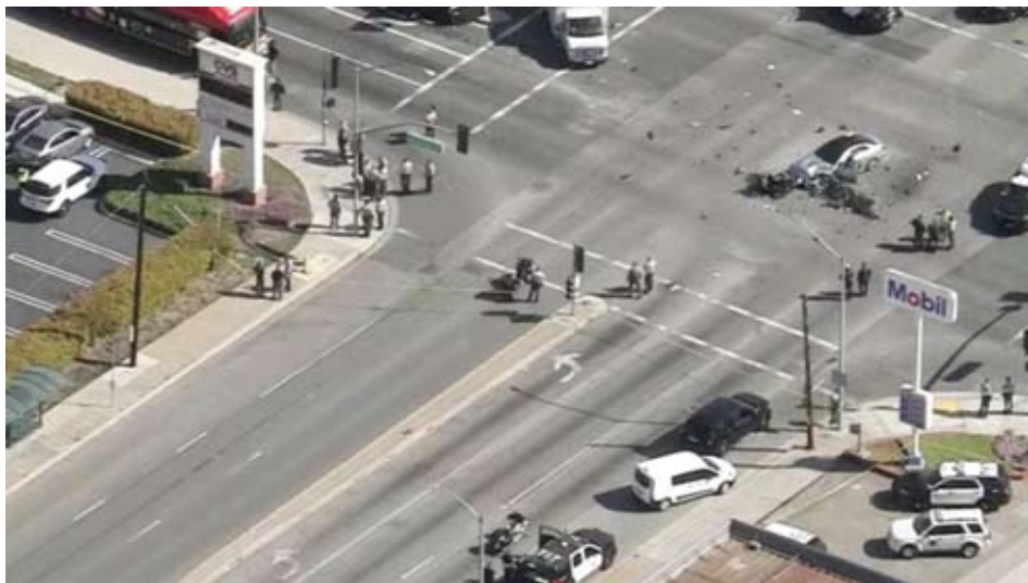
INVESTIGATORS around the Lakewood Deputy crash site at Del Amo and Paramount that happened yesterday. A flag was placed over the deputy's body at the scene.