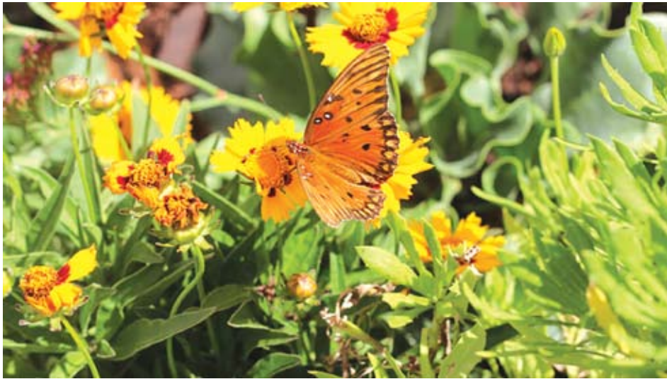
A MONARCH BUTTERFLY at the exhibit. The butterflies will be in all stages of the life cycle. The exhibit runs from April 1 to the end of July.