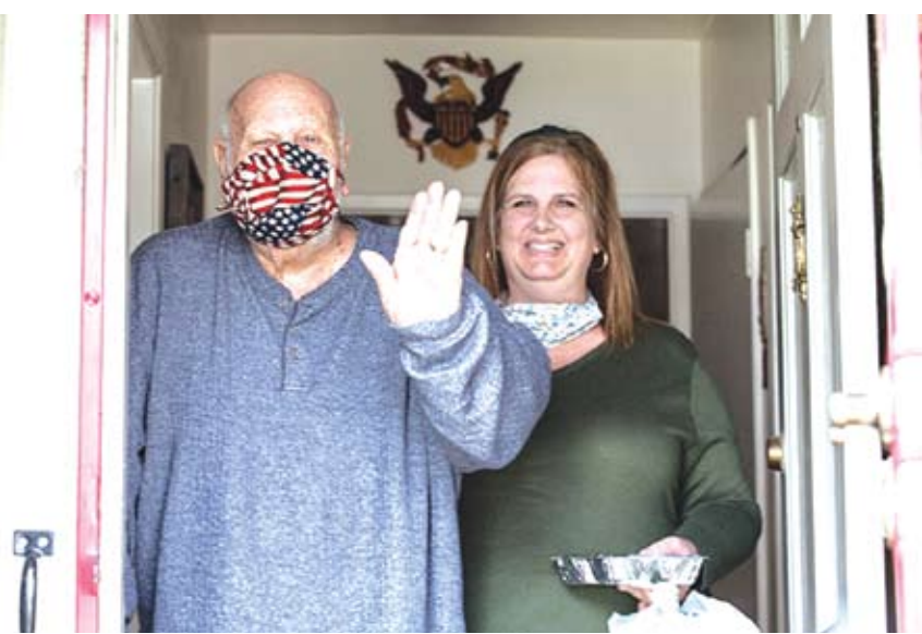
A LAKEWOOD VOLUNTEER delivers food to homebound residents in Lakewood. You can sponsor food delivery by calling 562.925.8784

For more information about how to join the Good Neighbor Sponsorship Program, contact Lakewood Meals on Wheels at 562-925-8784.