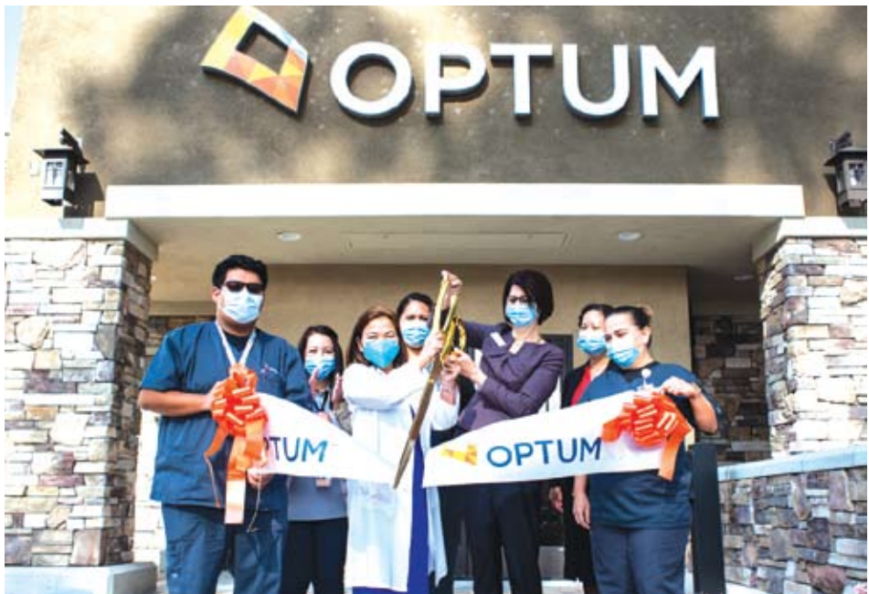
OPTUM local physicians, clinicians and support staff at the newly renamed Optum Medical Clinic located at 13357 South Street in Cerritos mark its transition from HealthCare Partners to Optum during a ribbon-cutting ceremony.

Local physicians, clinicians and team members at the 13357 South Street medical clinic in Cerritos recently marked the change of its name from HealthCare Partners to Optum with a ribbon-cutting event. The clinic installed new signage and renovated its patient areas inside.