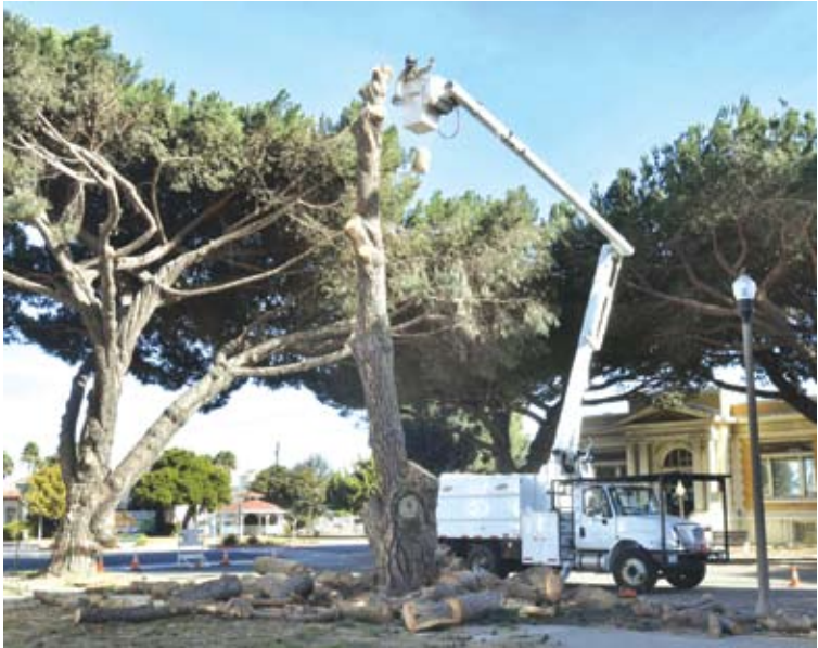
TREE REMOVAL - the city is also looking at prioritizing tree removal and using Measure M funds rather than general funds.

Of note here is the city looked at attempting to recycle the pinewood but all of the recycling