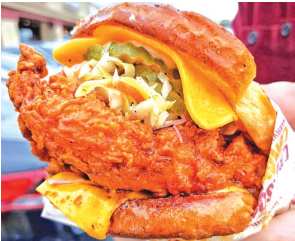
DOWNEY FAVORITE: The Crimson Coward's chicken on Lakewood Blvd. in Downey has "enough heat to push your eyebrows back."

Hot Motha Clucker is one of many modern interpretations of Nashville-style hot chicken, far from the original intent and execution but still tasty on it sown. This outfit leans into the messiness with extra-saucy sliders