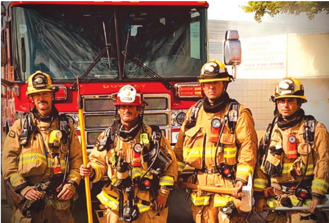
MEMBERS of the Downey Fire Department take a break during a call. The department was awarded ISO Class Rating 1, only 1 percent of the fire departments in the state receive the designation.