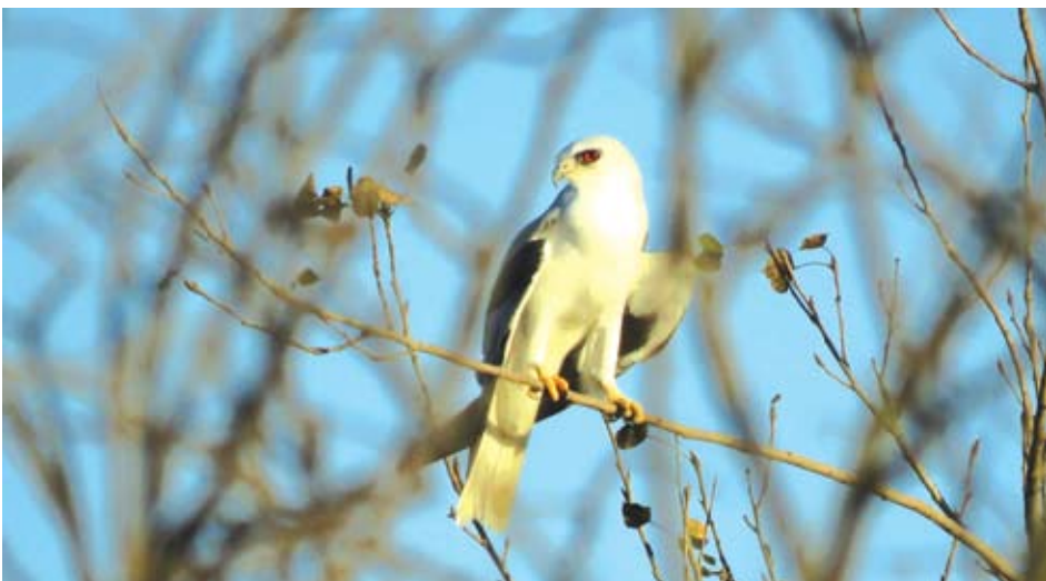
A WHITE TAILED KITE at the Ballona Wetlands. The fossil fuel companies have only one real agenda; to restore the crumbling oil wells and gas pipes that lie underneath the 640 acres of wetlands.

Seven species on the state or federal endangered species lists rely on the Ballona Wetlands for partial or all of their life cycles. Three of these special status species, the Least Bell's Vireo, Ridgway's Clapper Rail and El Segundo