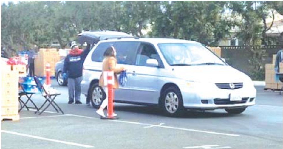
STUDENTS and community members participate in the food giveaway at Cerritos College in lot 10 Jan. 27, 2021.

A web-based wish list will be released soon, but in the meantime, anyone who wishes to make donations can contact me at psepulveda@cerritos.edu ," said Sepulveda.