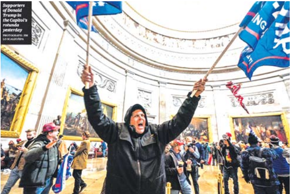
THURSDAY FRONT PAGE of the Guardian Newspaper in the UK.

The vice president then becomes acting president.