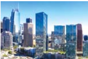
Not Good to be No. 1 FEMA ranks Los Angeles riskiest county in nation. Page 13.