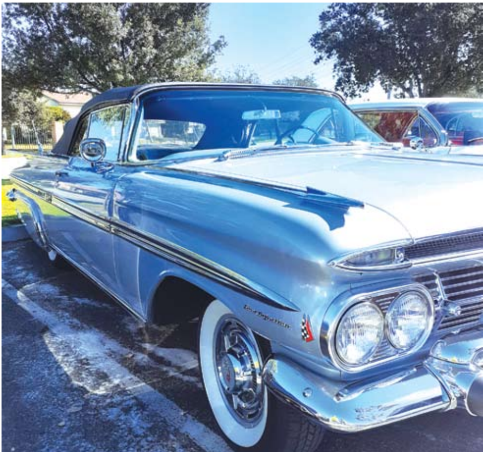
MINT 1959 Chevy Impala (above) with every original available option. EPIC FAIL: 1963/64 Chevy Impala (below) all ‘decked out’ had a hydraulic malfunction, spun out and crashed into a tree as it turned the corner to Don Knabe Park.