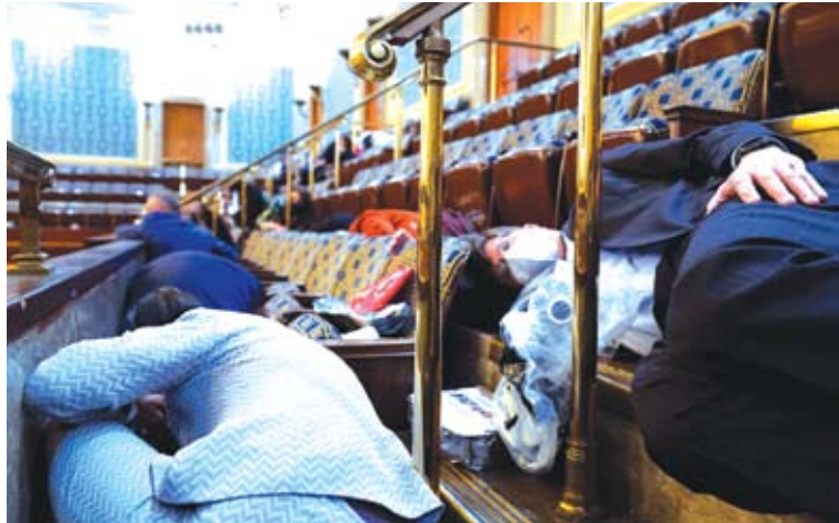
LAWMAKERS hunker down in the gallery area inside chambers.