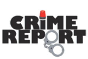
Cerritos and La Mirada Several cars stolen in Cerritos and La Mirada. Page 7.