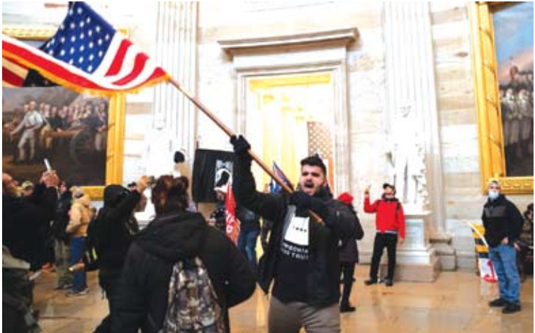
DOMESTIC TERRORISTS inside the Statuary at the Capitol.