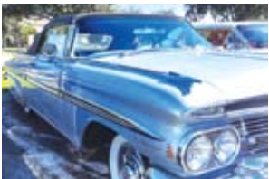
Car Show Annual car show at Knabe Park drew over 100 cars. Page 6.