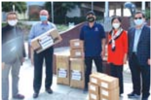
Donation to Cerritos Two companies donate PPE to the city. Page 4.