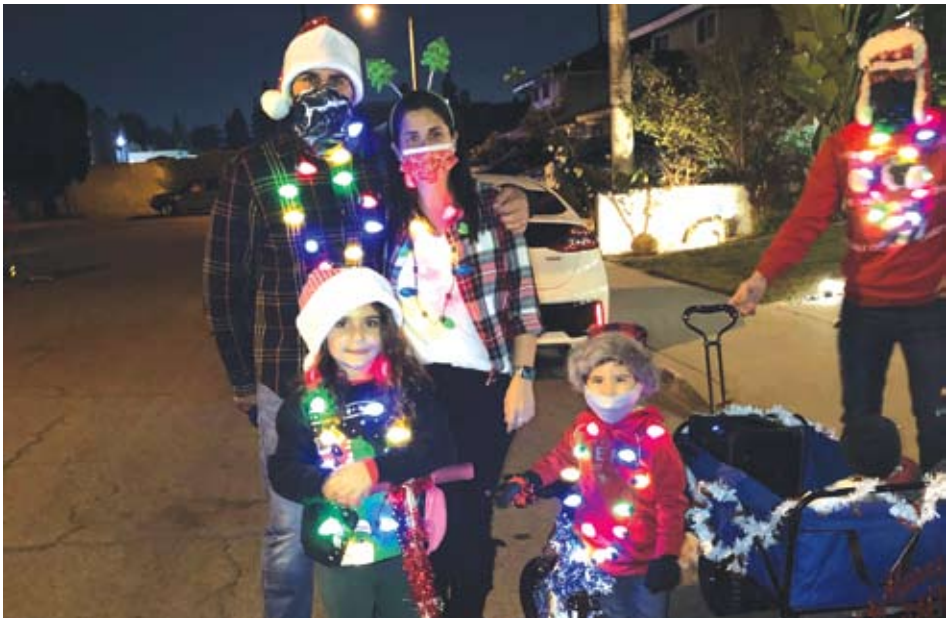
OVER 60 Artesia families participated at the December event, with residents setting up tables of goodies in their front yards and inviting everyone as they walked by to grab a snack.