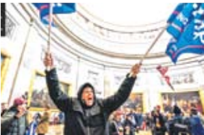
Five Front Pages What the world thought of the capitol attack can be found on several pages.