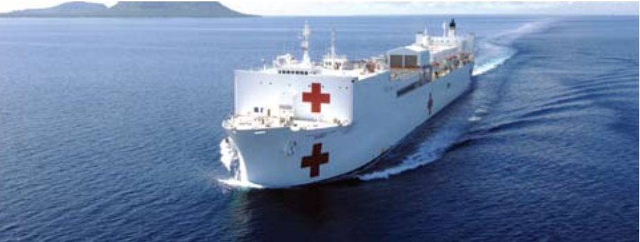
THE SHIP SERVED as a referral hospital for non-COVID-19 patients that were admitted to shore-based hospitals providing care for adults. Mercy's support allowed local hospitals to focus on treating COVID-19 patients.