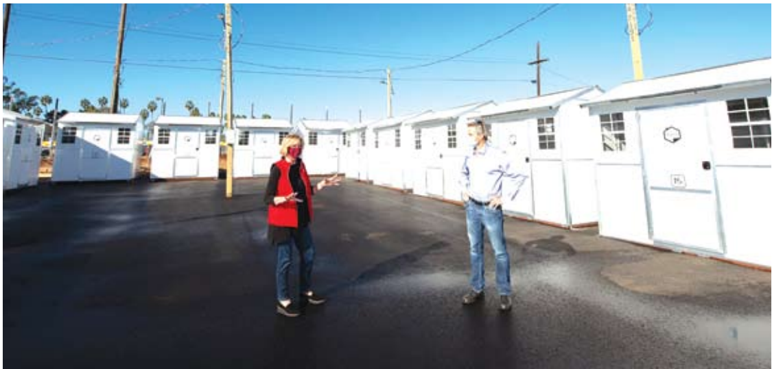
TINY BUT MIGHTY: Fourth District L.A. County Supervisor Janice Hahn with Redondo Beach Mayor Bill Brand surveying pallet houses for the homeless. The houses are 8 x 8 foot and can accommodate one or two people inside, with drop down beds, power outlets, heaters, and personal locked storage areas.