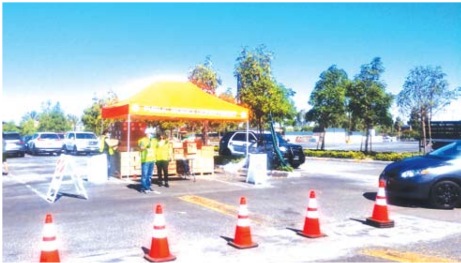
THE GARDENS CASINO partnered with AFSCME 36 and the L.A. Regional Food Bank to provide food to those who have been impacted by COVID-19.