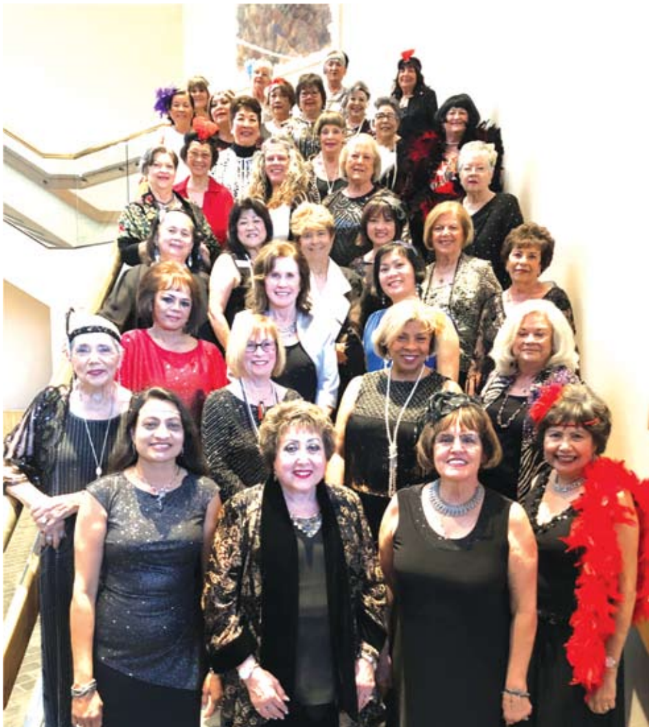
MEMBERS of Soroptimist International of Artesia-Cerritos. The proceeds of the event funded the Club's awards/scholarships to low-income, head-of-household college women; career training for local high school girls; and donations to community organizations (Su Casa-Ending Domestic Violence, Community Family Guidance Center, etc.) and Soroptimist education.