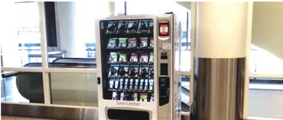
NEW NORMAL: PPE vending machine at LAX offers everything the traveller needs, even N95 masks. The machines offer touch-free payment options were installed in August of this year.