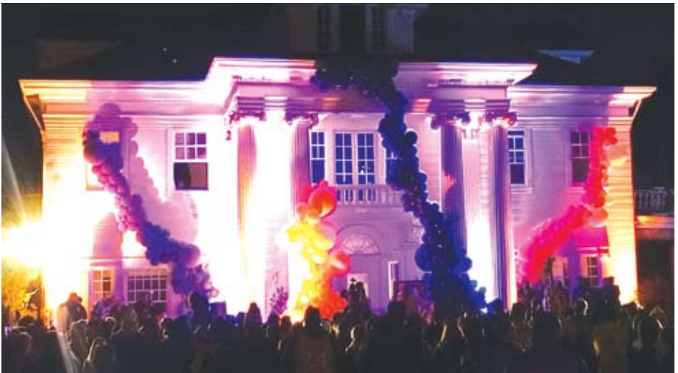
RIVES MANSION in Downey is adorned with Los Angeles Laker purple and gold lights and balloons in honor of basketball superstar Kobe Bryant, his daughter Gianna, and the seven other crash victims.