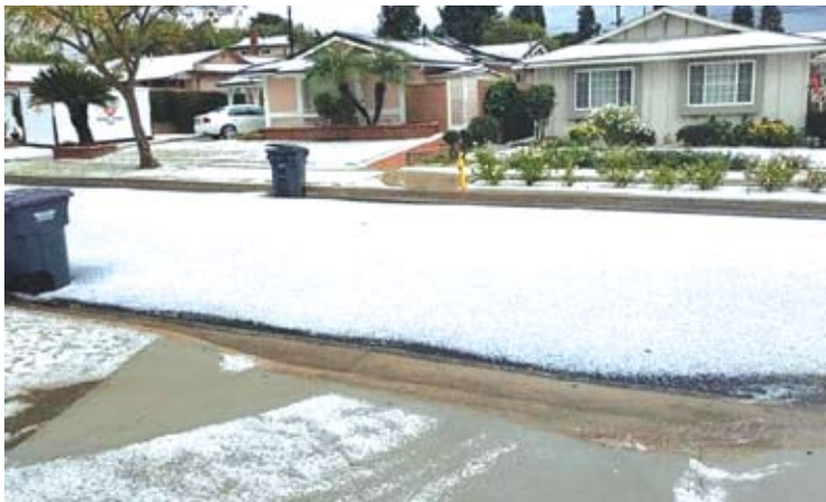
SNOW?: a La Mirada resident sent this picture in after hail hit in the city. The city was blanketed with more than an inch in some places.