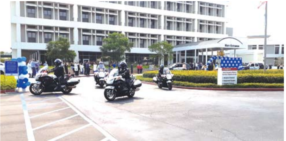
LIGHTS AND SIRENS blaring, Downey PD participates in the celebration of PIH Health Downey's centennial. The staff also buried a time capsule in the Rose Garden.