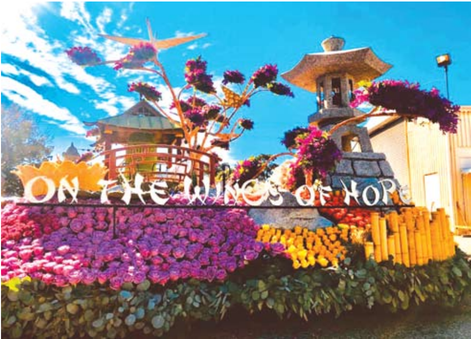
DOWNEY'S FLOAT for the parade won the prestigious "The Founders Trophy."