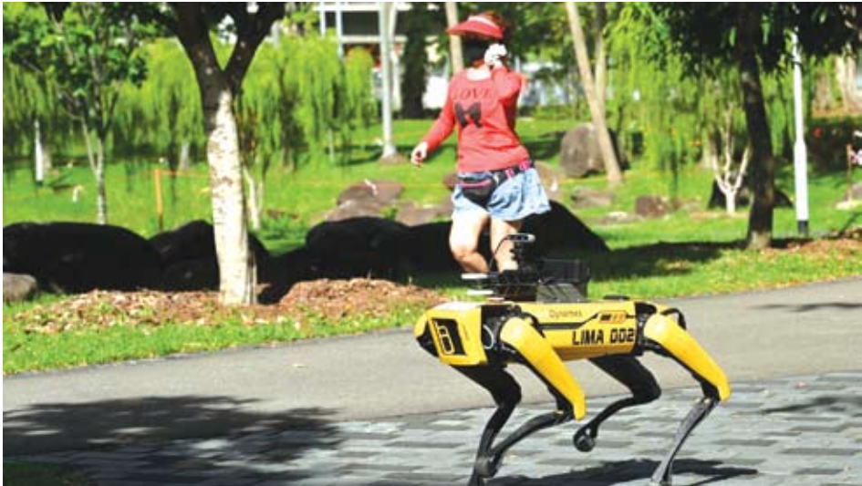
SPOT broadcasts a prerecorded message about how to maintain a safe distance from other people, authorities in Singapore said. It is remote controlled.