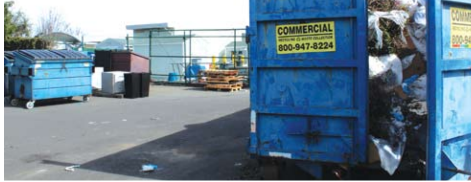
CAMPUS CUSTODIANS have expressed concern over the new college dumping site location. On Feb. 12, officials said that it is to keep trash "away," but the dumping site is next to the Child Developments Center.