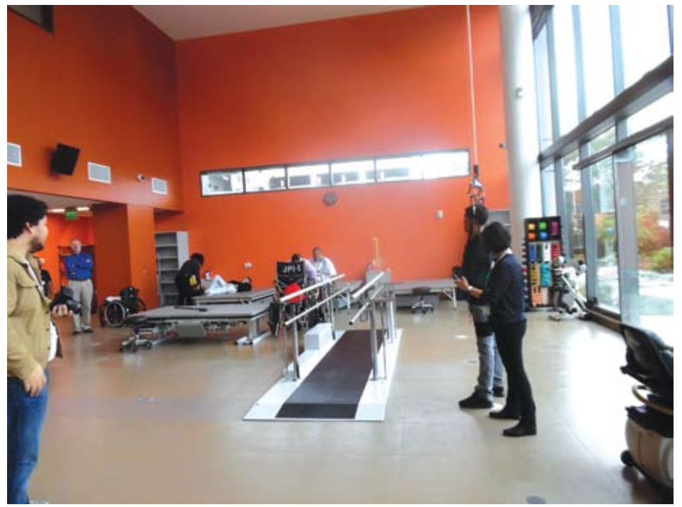
A NEW rehabilitation/therapy room at Rancho Los Amigos.