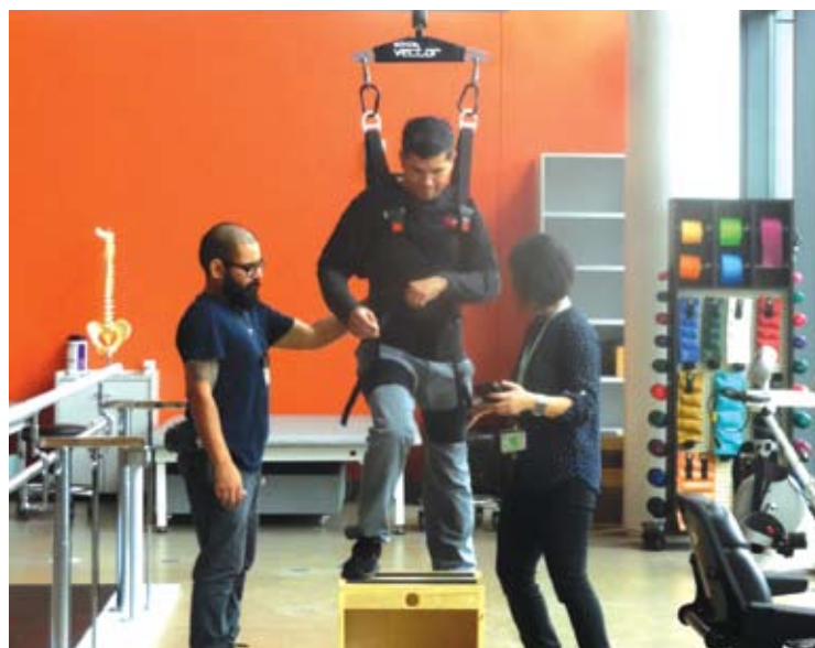
A PATIENT is harnessed into a robot system that allows him to relearn simple walking and stepping up actions.

HMG was invited to follow the journey of patients at Rancho, take a one-on-one tour of the