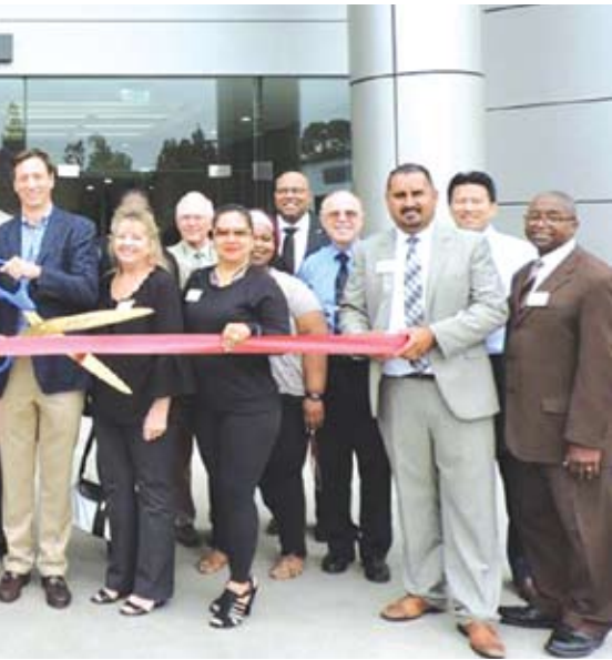
celebrating that the recent renovations to the building are