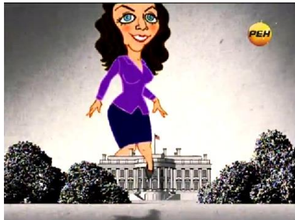
Simonyan steps over the White House in the introduction from her short-lived domestic show on REN TV (REN TV, 26 December 2011)