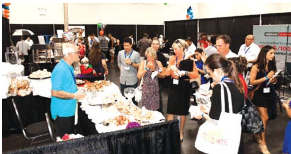
Attendees at the first annual Catercon 2016 sample some of the food at the event. Produced and hosted by Business Expo Center, CaterCon 2016 was the first annual expo dedicated entirely to anyone planning and organizing an event. CaterCon gathered caterers, wineries, breweries, event suppliers and entertainers all in one place.