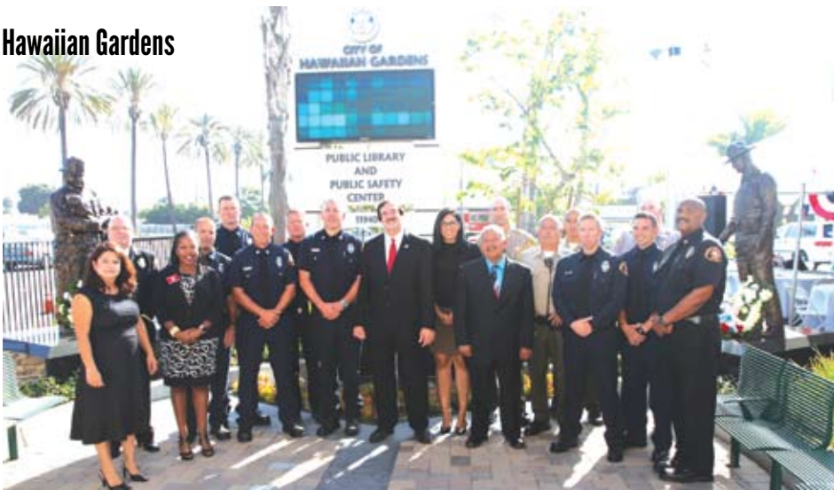
Hawaiian Gardens City Council along with other local, sheriff's, and fire officials at the City's 9/11 Patriot Day tribute.