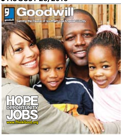
Thank you for donating & shopping at Goodwill®

Did you know? In 2015, we assisted more than 11,000 individuals and placed 435 of them into jobs!