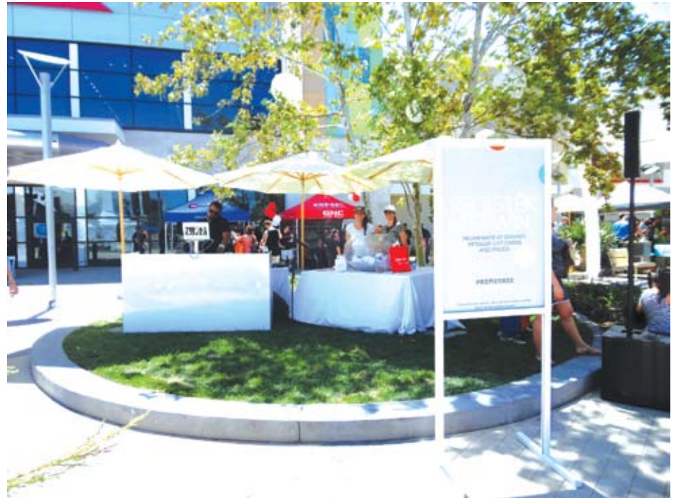
PROMENADE AT DOWNEY - The Plaza is of historical significance due to the World War II aircraft manufacturing facility Vultee Aircraft Manufacturing who made their home in Downey creating eight-passenger planes and the twin engine Douglas DC-2's and DC-3's along with attack aircraft for the United States.