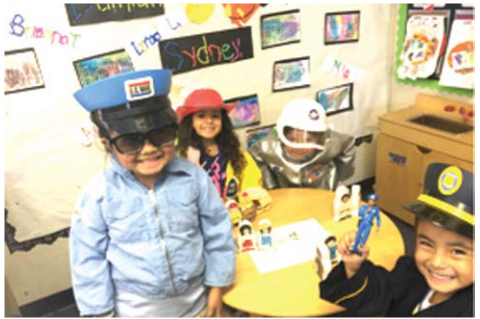
Hawaiian State Preschool during dress-up as Community Heroes day. State Preschool offers both morning and afternoon sessions at four sites: Artesia High School Children's Center, Fergeson Elementary School, Hawaiian Elementary School, and Palms Elementary School.

Children who qualify for preschool program receive either breakfast or lunch at the beginning of the class. They are taught many skills to be ready for life