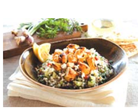
Mediterranean Chicken Salad - Chopped all natural chicken, Israeli couscous, tomato, cucumber, red onion, fresh mint, Italian parsley, green onion, feta cheese, tossed in a house vinaigrette and served on a bed of lettuce.