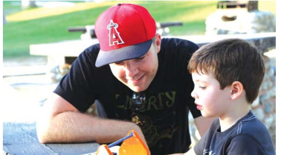
Fathers and sons pitched tents, enjoyed dinner, and made crafts at the Father Son Campout held at Neff Park in La Mirada on August 12-13.

The annual Father and Son Campout was held at Neff Park in La Mirada last weekend.