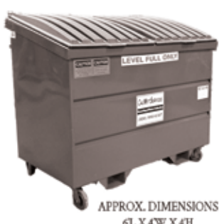
APPROX. DIMENSIONS 6L X 4W X 4H