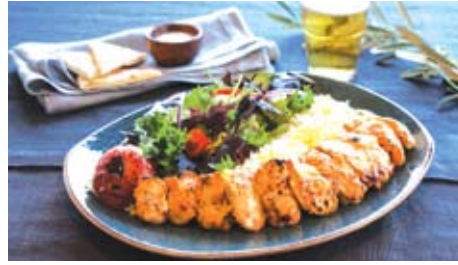
Chicken Kabob plate - Succulent pieces of boneless chicken tenders, served with Basmati rice and house salad.