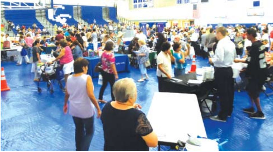
Hundreds of local senior citizens packed the Student Center at Cerritos College for free information, screenings and health education.