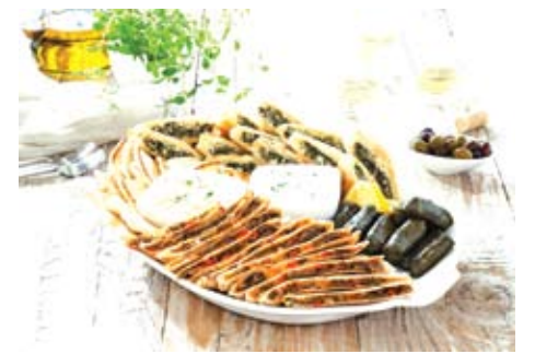
The Sampler Platter - four rounds of falafel, four stuffed grape leaves, couscous medley, hummus and pita bread.