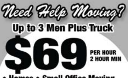
Homes Small Office Moving