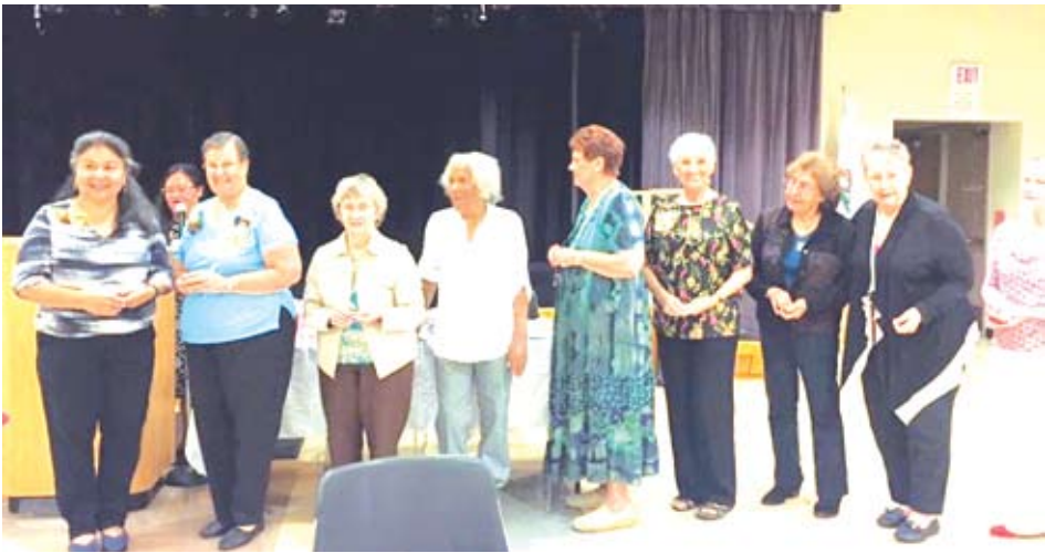
Pictured are the new President and Board for the Cerritos/Artesia Women's Club. The club is entering its 102nd year.

As the club starts its 102nd year, they recently installed a new board with a new president.