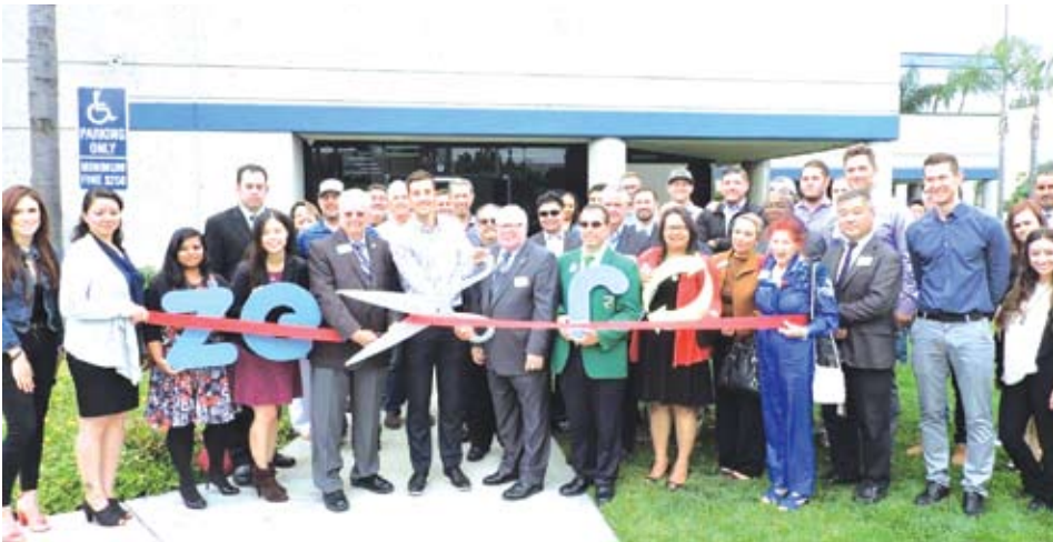
The Cerritos Regional Chamber of Commerce welcomed Zero Energy to the business community May 17th along with elected and community leaders. With more than 51,000 home energy audits, Zero Energy has become the trusted home advisor throughout Southern California and was recently named Performer of the Year for “Energy Upgrade California.”