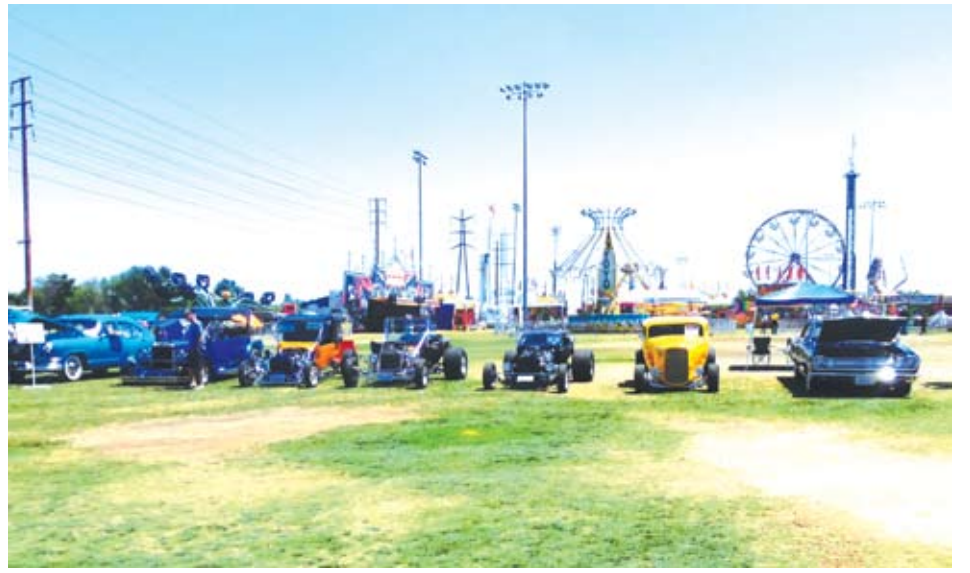
CAR SHOW: Saturday was highlighted by a vintage car show featuring classics of the early 50's and 60's.

A variety of gourmet food trucks were on site providing an array of specialty menu items from the ever favored funnel cake to grass-fed Angus hamburgers, and of course the usual corn dogs, waffle cones and cotton candy were available.