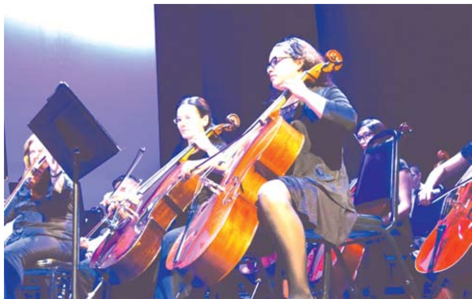
Thirty NLMUSD middle school musicians received their first experience performing on the big stage when they joined with the La Mirada Symphony for a pair of performances April 19 at the La Mirada Theater for the Performing Arts. More than 1,000 District students in the audience.

In a light moment, Mautner invited four NLMUSD elementary school students on stage to play a variety of unlikely percussion instruments – a slide whistle,