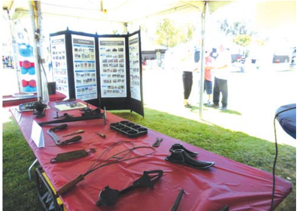
The City supplied a display of early city history, old newspaper announcements, and original farm equipment. Several old City tiles were on display as well as awards presented to the city throughout its sixty year history.

In 2015, we assisted more than 11,000 individuals and placed 435 of them into jobs!