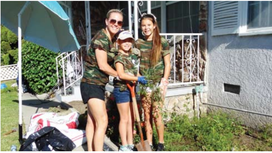
Mother and daughters weed and plant fresh flowers in a Lakewood resident's planter. "It's just a nice feeling," said one of the girls, "I do it just because I want to be nice."