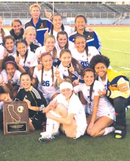
celebrates after their win over Moorpark.