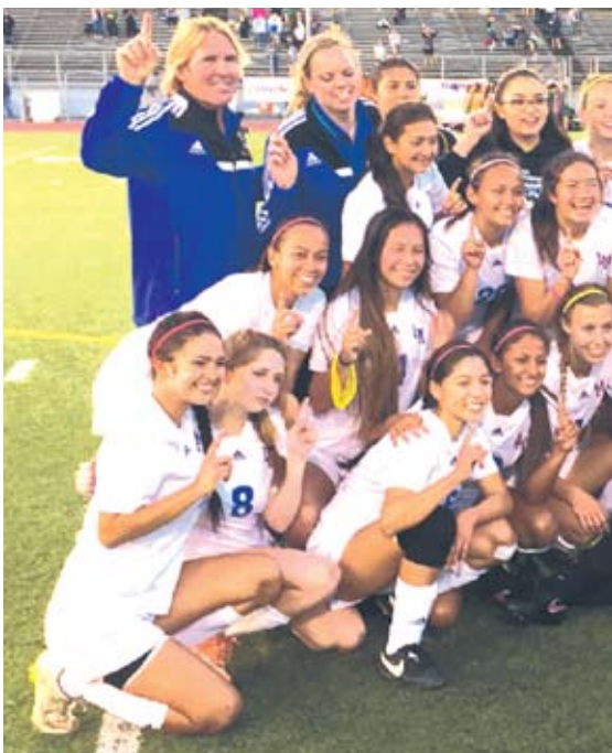
The La Mirada Girls Soccer Team celebrates their victory.