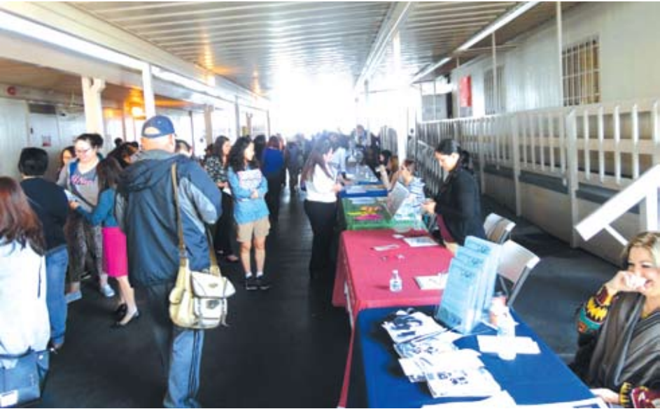
Over 2,000 people attended the ABC Adult School Career Fair and Open House on March 4. Over 40 industry experts and vendors participated in this year’s event.

The school is all about ‘Learning for Life’. Many classes are also offered to the general public such as sewing, quilting or ball room dancing.