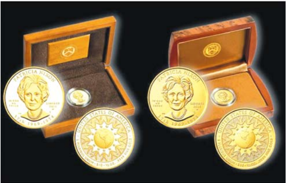
Proof and uncirculated 2016 Patricia Nixon First Spouse Gold Coins and their presentation cases.