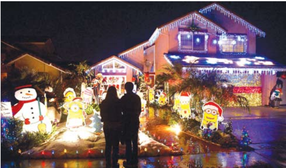
This house in La Palma won the holiday home decorating contest, the address is withheld at the request of the city.