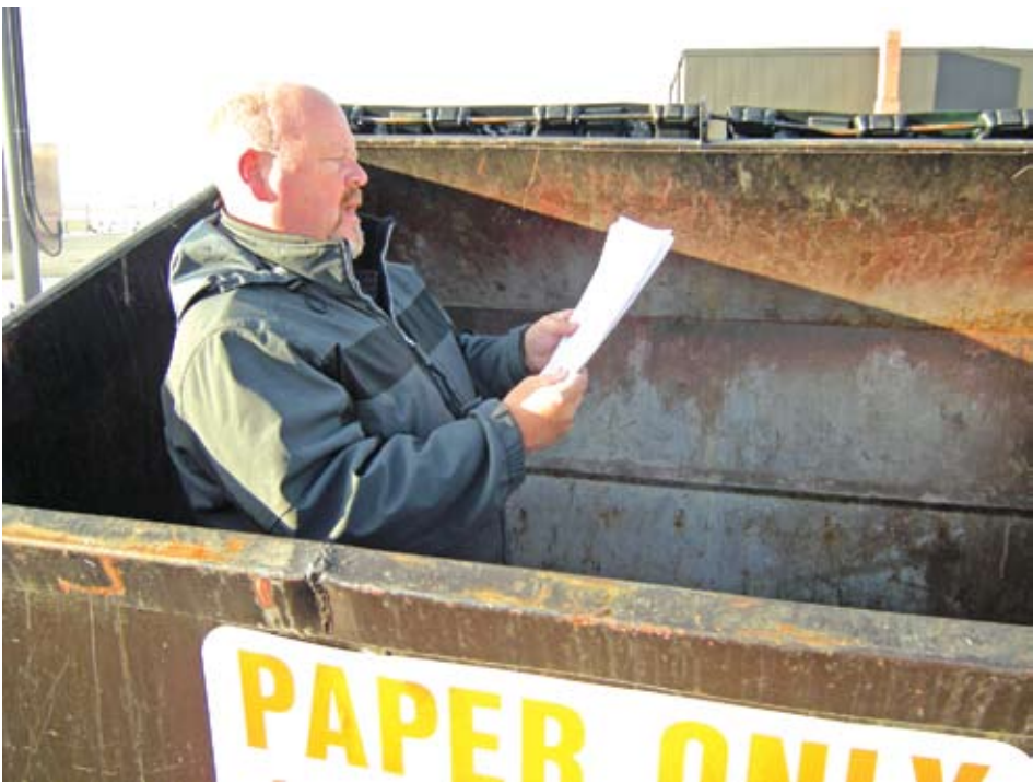
Trash theft is illegal in Cerritos, yet the Cerritos Sheriff’s Station/Community Safety Center periodically receives complaints of late-night trash rummaging. Call the Cerritos Sheriff’s Station at (562) 860-0044 if you see someone rummaging through trash.

scheduled pickups by non-profit groups should clearly mark the bag or item for pickup by the designated organization. Pickup from non-profit groups should be scheduled for a specific time of day, if possible. Some groups are willing to call a resident’s home when they are a short distance away from the location so the items do not have to be left unattended for a lengthy period of time.