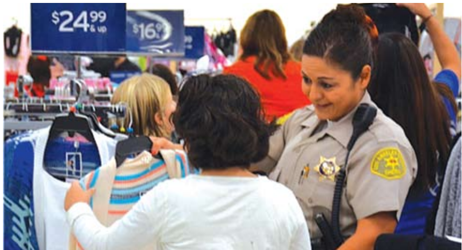
ROTARY HELPING CHILDREN: Los Angeles County Sheriff's Deputies were among the community volunteers assisting with the event.