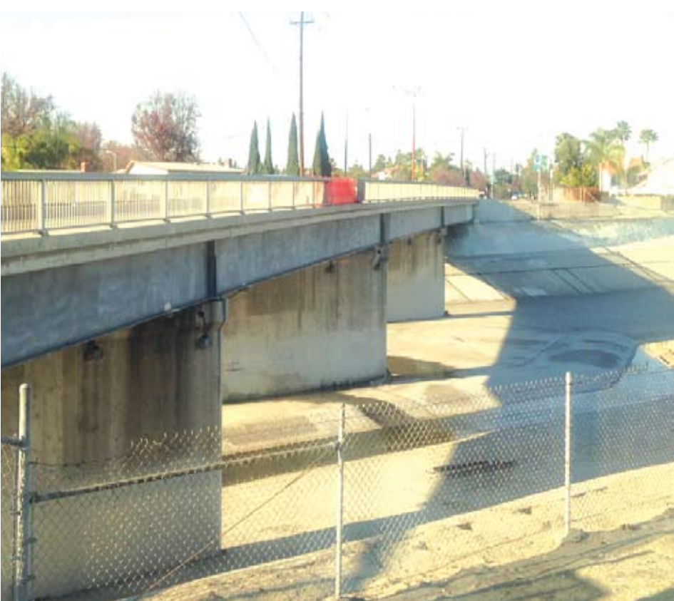
The section of the Marquardt bridge taken out by the SUV. The sidewalk is closed at this time. A full search and rescue occurred after the crash using helicopters and swift water rescue personnel. No one was found.