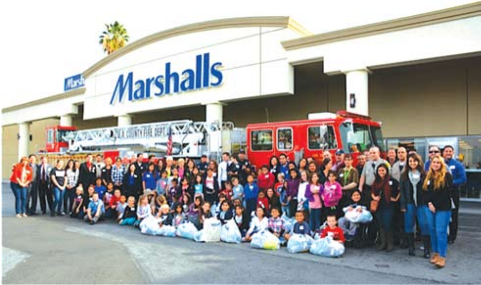
CLOTHES FOR KIDS: La Mirada Rotary and many community volunteers hosted some 50 local children during the Clothes for Kids events at Marshalls Department Store. Each child received $125 in new, warm clothing. A holiday celebration was held afterwards at the La Mirada Activity Center.