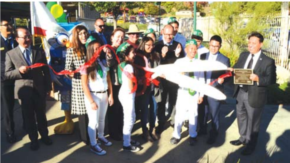
Macy Intermediate School 4-H students joined by their principal, Montebello Unified administrators and community in cutting a ceremonial ribbon to commemorate the completion of the school’s new-drought conscious landscape Dec. 15.

The xeriscape offers students an opportunity to learn about water conservation, including how to use that knowledge