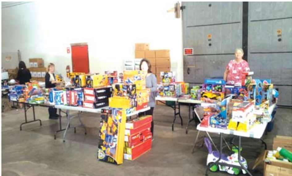
Soroptimist International of Artesia-Cerritos members help with food and presents for needy families. Under the clubs' leadership, the Needy Family Project has become a sophisticated operation of love and giving that has now reached its twenty-sixth year of operation. Look for club members collecting non-perishable food items outside local Ralph's Grocery Markets on December 12 and 13.

The Cerritos Optimist Club will once again be partnering with Soroptimist International of Artesia-Cerritos for their annual Needy Family Project supporting over 30 families in our community. Each of the families, which are