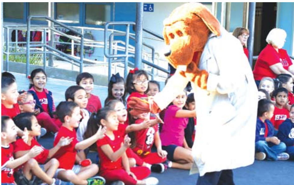
Deputy McGruff, the crime-fighting dog, attends the Red Ribbon Week assembly at Escalona Elementary School and helped lead students in cheers to promote living a drug free life.

October 26 through October 30 was proclaimed as Red Ribbon Week in the City of La Mirada at the October 27 City Council meeting.