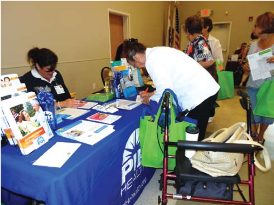
Health fair participants sign up at the PIH Health table for screenings, more than 200 people attended the health fair at the Norwalk Senior Center.