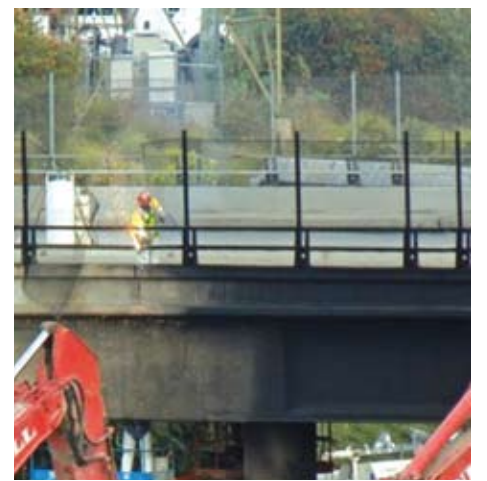
Inspectors check bridge after fire, both companies involved in the fire were found negligent.

the driveshaft detach, he stopped the front part of the big rig truck under the Paramount Boulevard bridge, where the tanker exploded, according to the state's complaint. The bridge, originally built in 1967, was shut down following the fire, which forced a lengthy closure of the 60 Freeway between the Long Beach (710) and San Gabriel River (605) freeways while Caltrans crews assessed the integrity of the structure. The bridge was demolished once it was determined the fire had caused too much damage. Its replacement, which opened ahead of schedule in May 2012, is 128 feet wide, 32 feet broader than the old one, and includes an additional northbound lane, an eight-foot shoulder, a 14-foot center median and six-foot sidewalks.