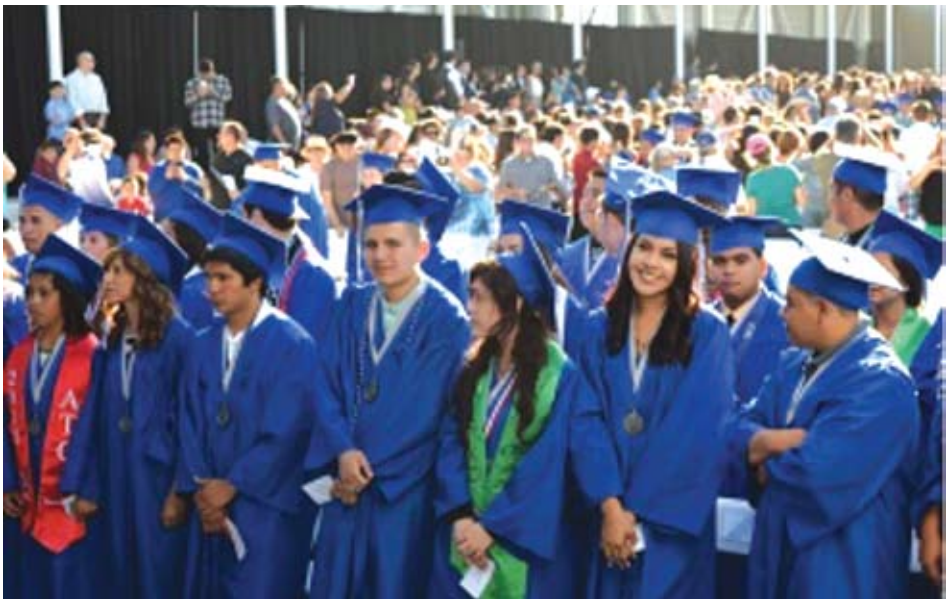
ATC graduates waiting for the the final word to throw their graduation caps.