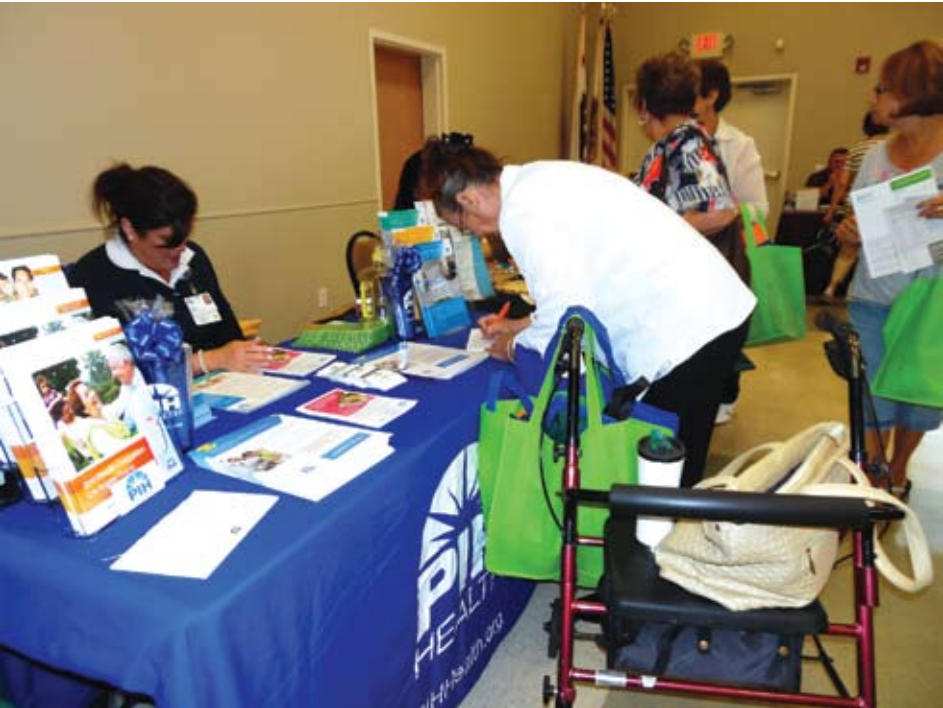
Health fair participants sign up at the PIH Health table for screenings, more than 200 people attended the health fair at the Norwalk Senior Center.

We all know that we will get older. Some of us may think about the aging process with fear and trepidation, while others embrace it – aging with style and panache. We will age; it is a part of life that we are rarely prepared for. With over fifty vendors, filling the lobby and three