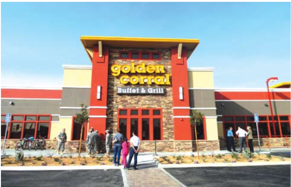
The new Golden Corral located at 17308 Bellflower Blvd., is one of the largest in the nation. The location has an open kitchen where customers can watch food being prepared.

James Maynard conceived the idea in 1971 and William F. Carl wanting to have a family style steak buffet. Golden Corral was incorporated in 1972 and the first Golden Corral Family Steak House opened on January 3, 1973, in Fayetteville, North Carolina. The company has since expanded to 500 locations across the United States; approximately 100 of them are company-owned. In 1987 the company decided to begin franchising by licens-