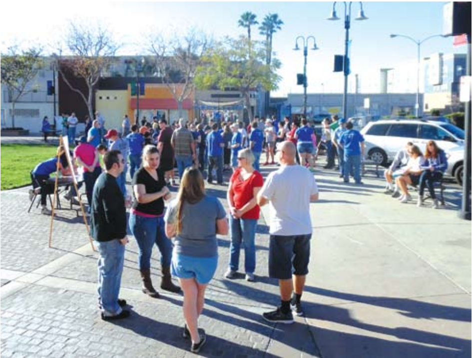
Volunteers gather in Bellflower for a "day of service." Volunteers did everything from planting flowers to washing windows on Bellflower Blvd.

Kingdom Causes is a program within the city of Bellflower that organizes with local churches in community outreach. Many of the churches have organizations that work outside of the city, in working together with the Volunteer Center and the Public Works Department, it was discovered there were many ways these organi-