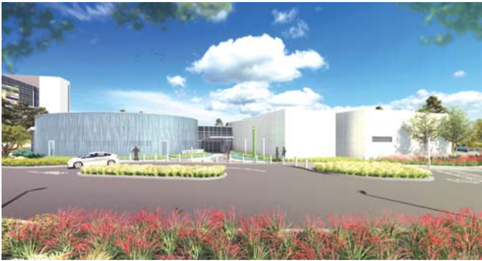
ARTIST'S RENDITION of Kaiser Permanente Downey Medical Center's recently Radiation Oncology Treatment Center in Bellflower.

Kaiser Permanente Downey Medical Center recently held a groundbreaking ceremony for a new Radiation Oncology Treatment Center on its Bellflower Medical Offices campus. The facility will be the fourth radiation therapy site in Kaiser Permanente's Southern California region – making radiation therapy much closer to home for members undergoing treatment for cancer in Southeast Los Angeles.