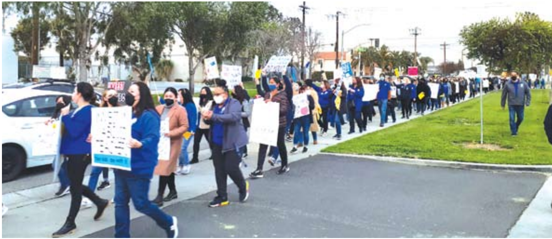
HUNDREDS of teachers and nurses rallied at last Tuesday's ABCUSD Board Meeting. They have worked two years without a contract, negotiations are still ongoing.

Serving Cerritos and ten other surrounding communities • February 18, 2022 • Vol. 36, No. 8 • LOSCERRITOSNEWS.NET