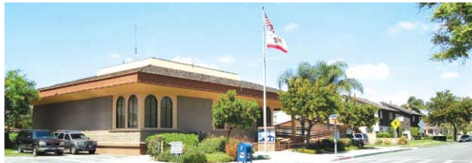
NEW ROOFING on City Hall allowed the City to reduce the energy consumption of the facility due to better insulation.

The City of Artesia has made significant efforts over the last several years to increase practices that are sustainable