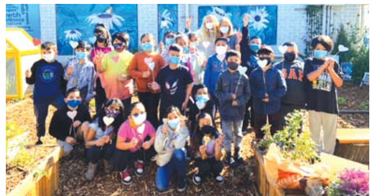
PALMS Accelerated Learning Academy teachers and students in the outdoor learning garden.