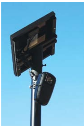
A SOLAR POWERED Flock ALPR Safety Camera similar to those that will soon be installed in Pico Rivera.

These systems do not record any video, only single photo-