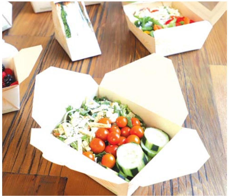
RENEWABLE COMPOSTABLE materials such as bamboo and corn are used by World Centric to make food service ware that reduces carbon footprints, and helps Californian's comply with the new 2022 composting law. All of World Centric's food containers are compostable and made without the use of tree products.

For more information about World Centric compostables and zero waste products, please visit online at www.worldcentric.com .