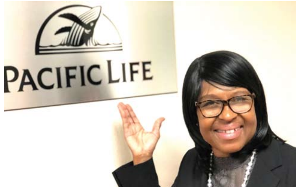
A WHW participant who got a job at Pacific Life company.