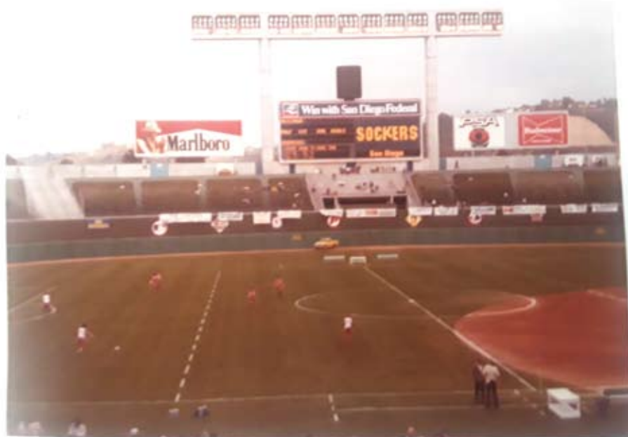
A JUNE 2, 1982 PHOTO taken shortly before the start of the San Diego Sockers North American Soccer League game against the Toronto Blizzard. At the time, it was known as Jack Murphy Stadium, in honor of San Diego's longtime sportswriter who was instrumental in building support in the late 1960s for the building of the stadium. The Sockers would call San Diego home from 1978-1984. Notice to the right of the scoreboard is an advertisement for the defunct Pacific Southwest Airlines, which was headquartered in San Diego.

I moved to America's Finest City 12 years after San Diego Stadium was built and it didn't take long before my family and I began to make frequent visits to it.