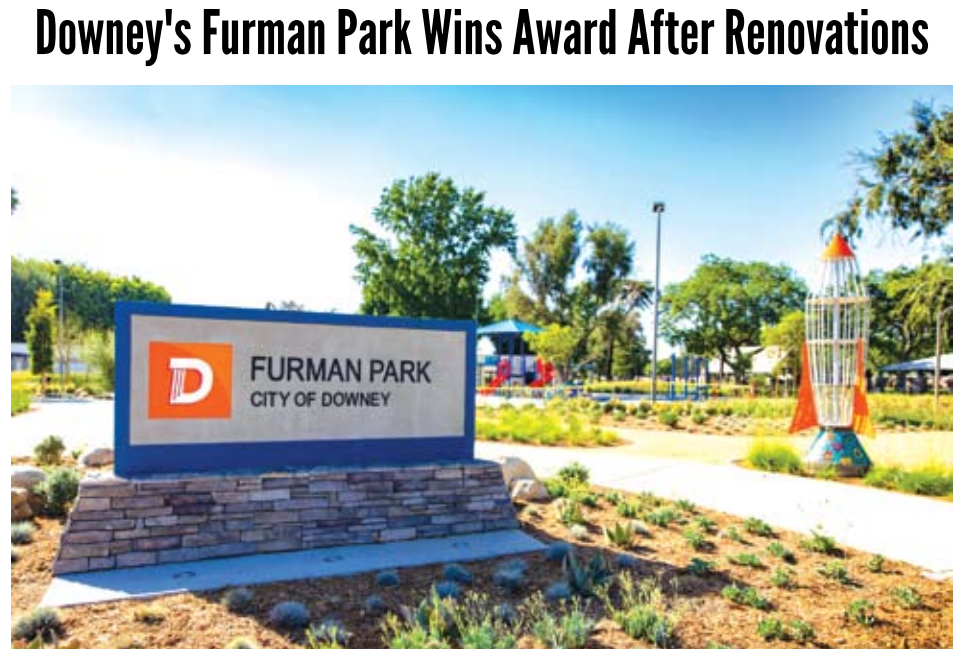
IMPROVEMENTS consist of upgrades to two existing buildings, a restroom remodel to meet accessibility standards, new irrigation system, recreational turf reseeding, jogging trails, sidewalks, plantings and park signage.