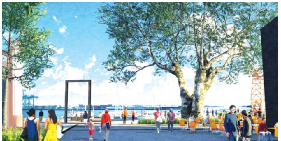
THE TOWN SQUARE project will include a promenade, and a four-acre square with harbor swings, and public seating connecting West Harbor to the Ferry Building.

Together we thrive. Connection is key to a longer and more vibrant life, and powers everything WE do at The Grove. It's like being part of a super supportive family of waiters, chefs, housekeepers, ZEST® activity coaches, care & wellness teams, and even a bunch of really friendly and fun neighbors, all helping you thrive. This is what "we're in this together" is all about. It's all here at The Grove at Cerritos senior living community.