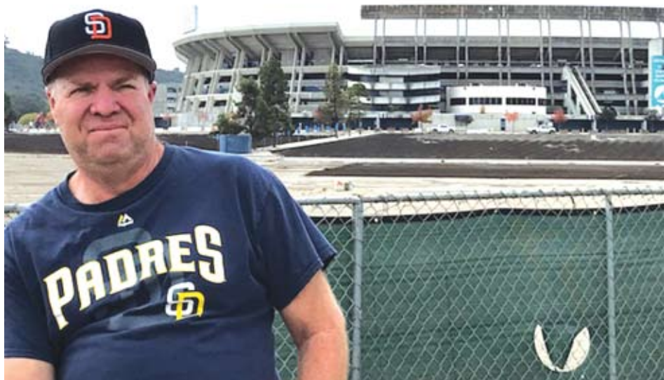
JUST OFF FRIARS ROAD in the Mission Valley area of San Diego sits the current San Diego County Credit Union Stadium, which is being torn down. The stadium has been a fixture of San Diego's history since 1967 and was home to several professional sports teams as well as collegiate events. Portions of the parking lot have already been dug up.

Sockers had its privileges as we were part of the team's booster club and would frequently go to what was once called Flannigan's Bar, at the corner of Rancho Mission Road and San Diego Mission Road, a mile or so east of the stadium, for post-game gatherings. Occasionally, we would make the short trip up Interstate 5 to see home games of the Los Angeles Aztecs and California Surf.