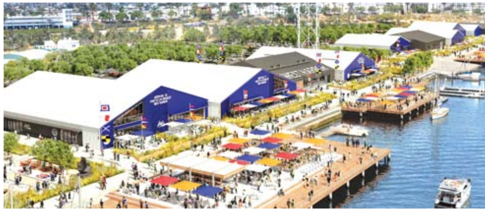
WEST HARBOR will be a dining and shopping destination and provide open space for the community. Gladstone's and other restaurants have already signed on.

The project is being funded by the Port's Public Access Investment Plan, which ties community infrastructure investments to a percentage of the Port's operating revenue. Since 2005, the Port has invested more than $700 million in waterfront capital development, programming and maintenance, with an additional $300 million in Port funding anticipated through 2025 under the Plan.