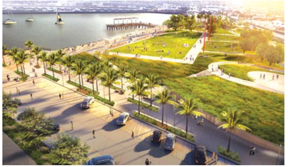
WILMINGTON WATERFRONT PROMENADE will be nine acres of open space and recreational areas, including a park, a public pier and a dock.

Los Angeles music promoter Nederlander Concerts will operate the 6,200-seat venue right on the waterfront.