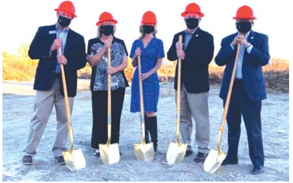
THE CYPRESS CITY COUNCIL pauses for a group photo at the groundbreaking. The park will be located on the corner of Lexington Drive and Cerritos Avenue.

In May of 2018, the city accepted a donation of nine acres for the purposes of constructing a park.