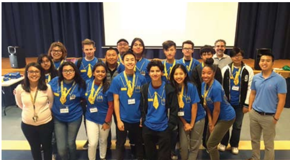
GREAT WORK! On Nov.18, 2017 Gahr officially launched the Math Center, one year later the volunteer peer tutors have provided over 1,196 hours of math help. The Math Center is open Tuesdays and Thursdays from 3 to 4:30 pm in the Gahr library.