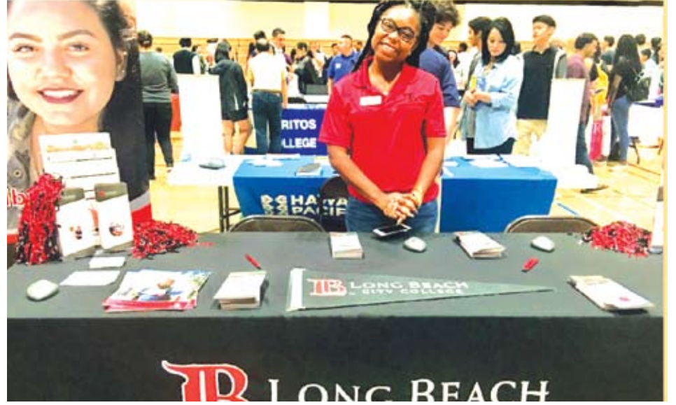
THE ANNUAL District-Wide College Fair was held at Whitney HS. Representatives from over 80 Ivy Leagues, UCs, CSUs, and community colleges were in attendance to answer questions to over 1,000 participants. All students and families of ABC high schools were welcome to attend