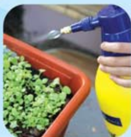
Sustainable Landscape Design