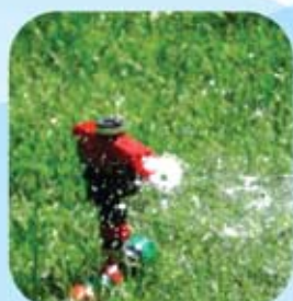
Sprinkler & Drip Systems Basics