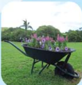
Water Efficient Gardening