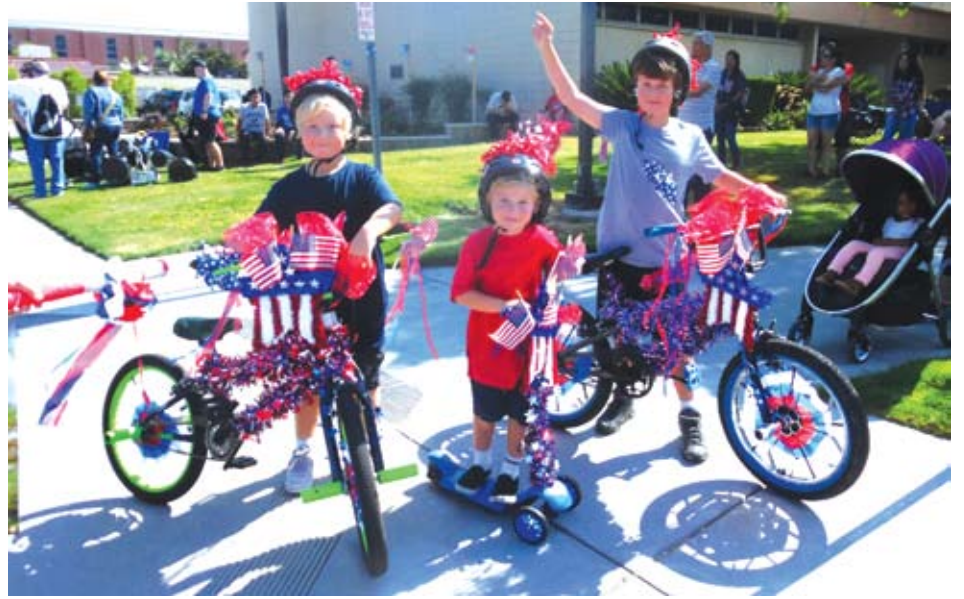
DECORATING BIKES - Artesia kids joined the parade after decorating their bikes in fourth of July regalia.