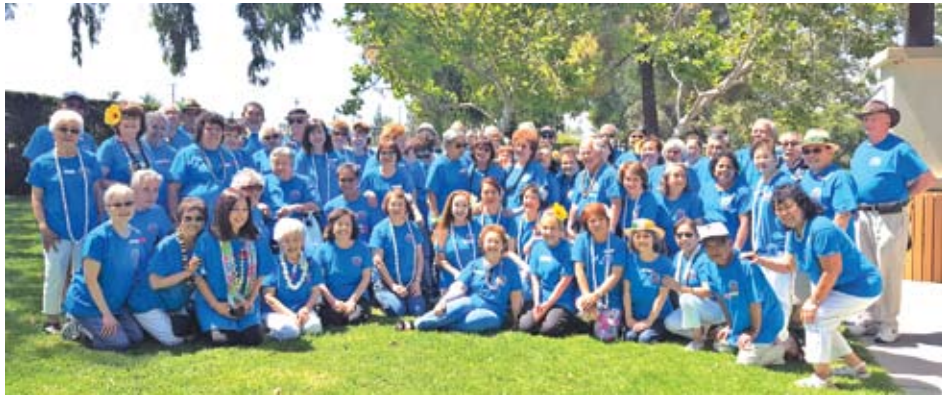
NEW BRIGHT BLUE SHIRTS were designed for Da' Hawaii Seniors Club's 20th Anniversary Celebration. Pictured are all those who purchased and wore the new club shirts on June 30, 2018.