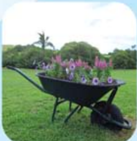
Water Efficient Gardening