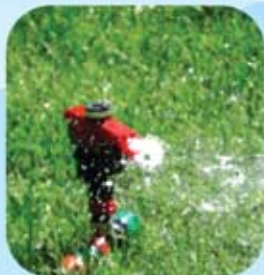
Sprinkler & Drip Systems Basics