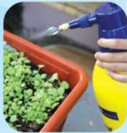
Sustainable Landscape Design