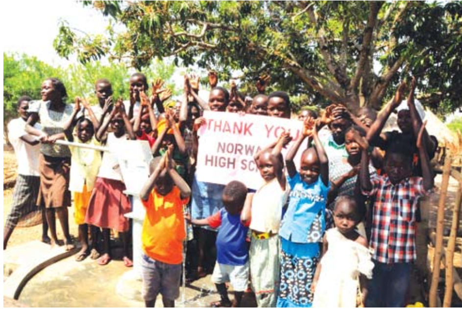
Pictured are children in Uganda offering thanks to Norwalk High for its donation through the non-profit Drop in the Bucket. Norwalk High School seniors raised $13,000 this school year for thirteen charity organizations including Drop in the Bucket. The nonprofit provides fresh water and sanitation systems for schools in Africa.