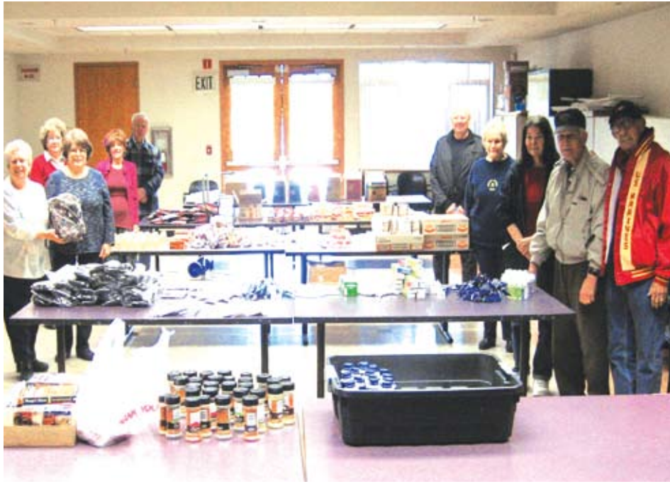
Pictured are 1st CEB volunteers at the packing area at the Cerritos Senior Center before assembly. The group sent a total of 46 packages.