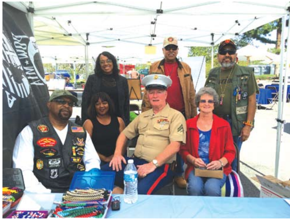
Veterans from different wars gather at the annual Welcome Home Veterans event at Rose Hills. The annual exhibition features a resource fair, car show, live band, food trucks and family activities

After hosting the wall for two years, Rose Hills decided to create a resource fair that would serve veterans and their families. "Sometimes veterans can be