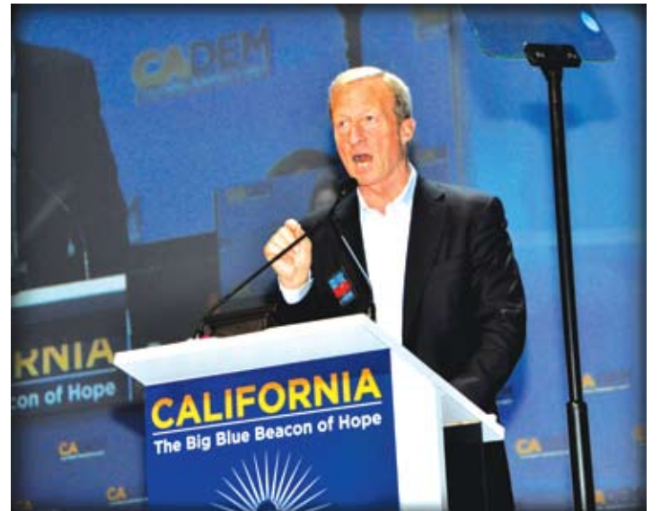
PICTURED LEFT: Los Angeles Mayor Eric Garcetti, who is exploring a Presidential run in 2020, stirs up the delegates with an emotional speech. PICTURED RIGHT: Billionaire Tom Steyer founder of Needtoimpeach.com that calls for the impeachment of Donald Trump.