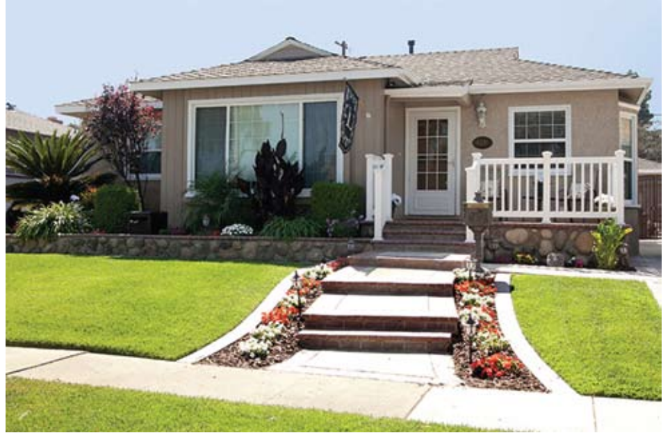
BEAUTIFICATION: A home in Lakewood that won an award over three years ago. Lakewood has three ways to honor your home or one of your neighbor’s through the Lakewood Beautiful Program.

For additional information please visit our website at www.rancho.org