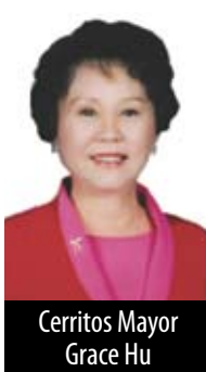
Cerritos Mayor Grace Hu

The City of Cerritos has approximately 28,000 trees in its urban forest. Of this total, approximately 25,000 trees are located in medians and parkways, with the remaining trees located in parks or at other City facilities.