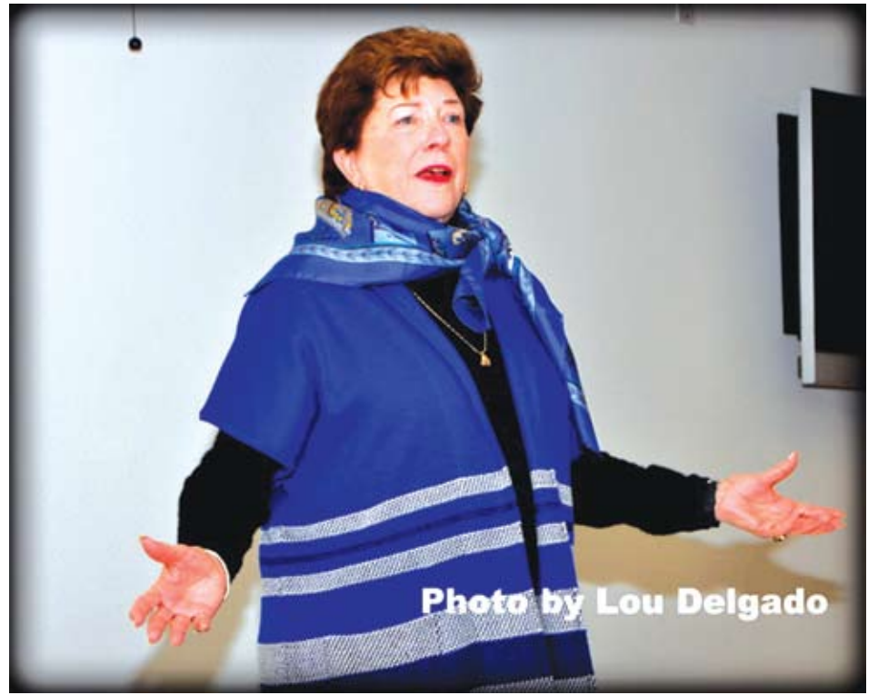
Gubernatorial candidate Delaine Eastin tells local community activists that she is ready to do the job that the office requires.

Eastin believes that Trump "is lying in the pockets of the rich with his tax policies, yet the state and country can move forward, and there is no excuse for California having the largest number and