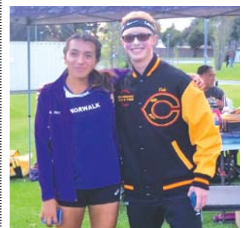
Norwalk & Cerritos HS runners win Suburban League. Page 13.