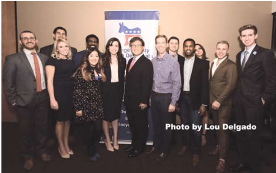
California State Treasurer John Chiang (center) and OCYD officers and members welcome more than 60 guests for attending their Nov. 3 Law & Politics event.