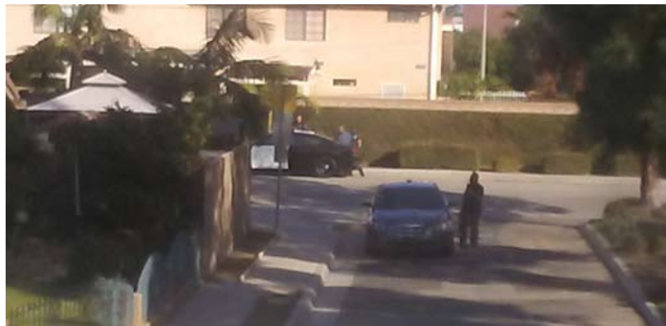
A man in his mid-twenties, (against black and white vehicle), who hid under a parked RV, was arrested near Squaw Valley and Denny in Cerritos. Witnesses said it took multiple police units and one undercover unit to apprehend the suspect. HMG-CN was told that another police agency served the warrant on the man for fraud and forgery charges.