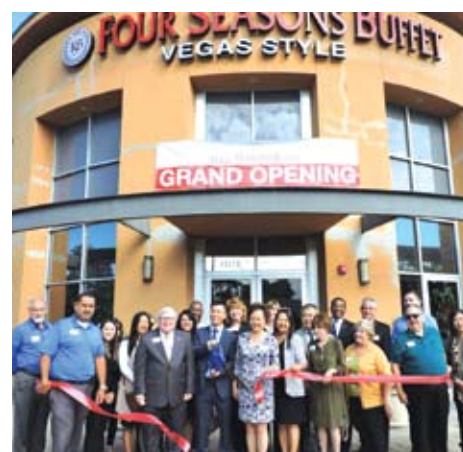
Bye-bye Hometown Buffet, hello Four Seasons Buffet. Page 9.